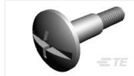
TE Part #208211-4 SCREW,SHOULDER,SPECIAL