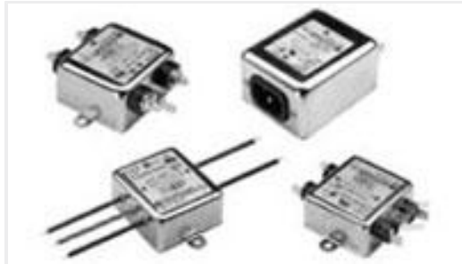
TE Part #1-6609028-7 20VK1=F7147 S0