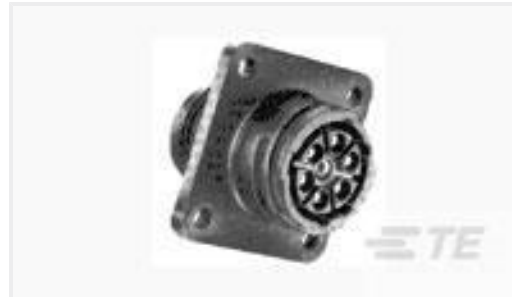
TE Part #211769-1 17-9 CPC RECEPT REV SEX