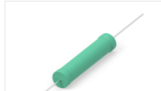
TE Part #9-2176614-5 EP 10W (SS) 8K2 5% BULK BOX