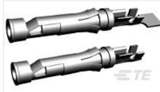
TE Part #66101-3 III+ SKT,18-16,15AU/FL,LP