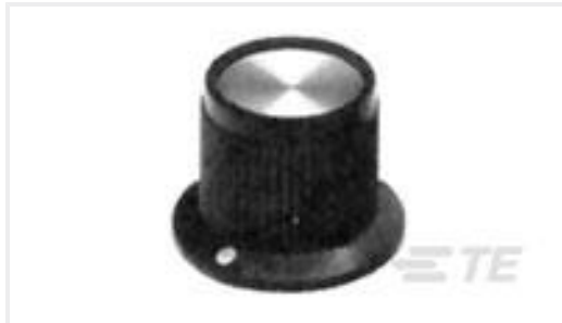
TE Part #1437624-7 PK50B1/8=KNOB PLASTIC BLK 1/8