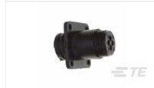
TE Part #206061-1 RECPT, SZ 11-4, CPC