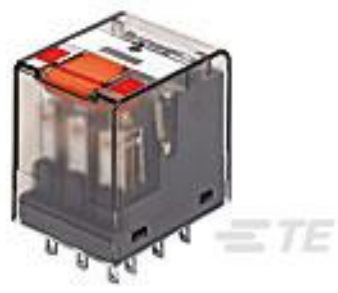
TE Part #1-1393154-2 PT570024