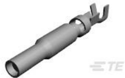
TE Part #770253-3 UMNL II SOK PTPPHBZ LP 24-18