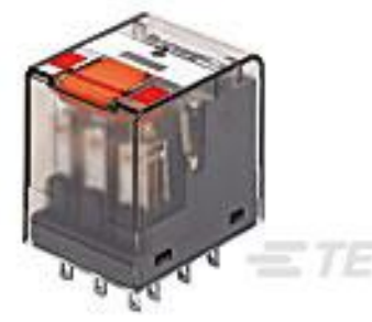
TE Part #9-1419111-1 PT570730