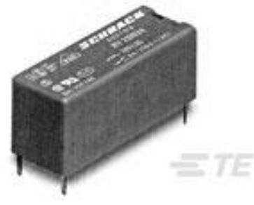
TE Part #2-1393225-9 RY612024