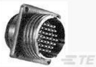
TE Part #183040-1 CPC SQ.FL.RCPT STD SEX SIZE