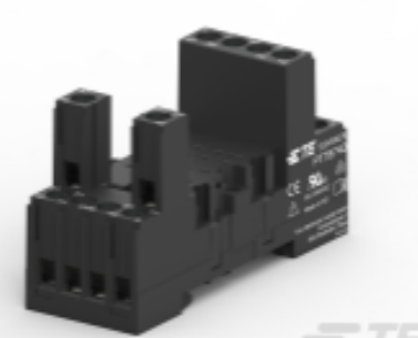
TE Part #4-1415033-1 PT78740