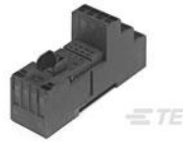
TE Part #1860000-1 PT7874P