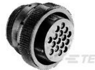
TE Part #183039-1 SIZE 17-14 CPC PLUG ASS'YSTD S