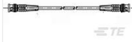
TE Part #1337769-4 50 OHM COAX BNC STR PLUG STR P