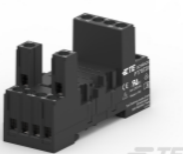
TE Part #6-1415034-1 PT78720