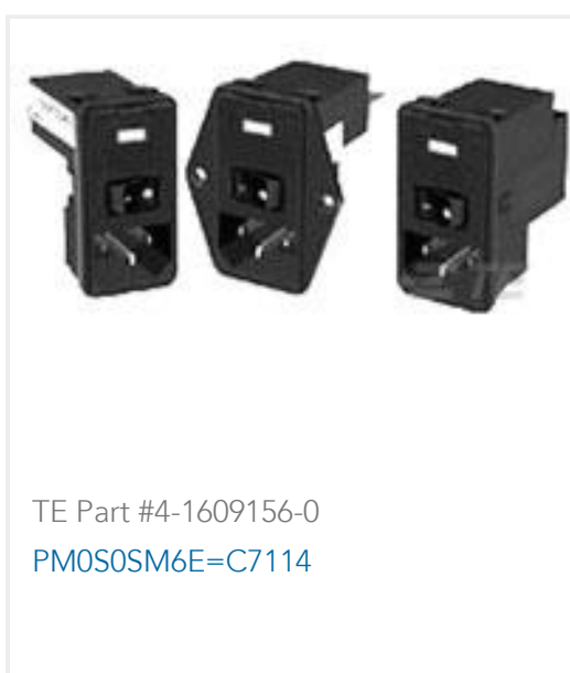
TE Part #4-1609156-0 PMOS0SM6E=C7114