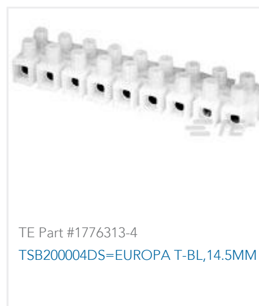
TE Part #1776313-4 TSB200004DS=EUROPA T-BL,14.5MM