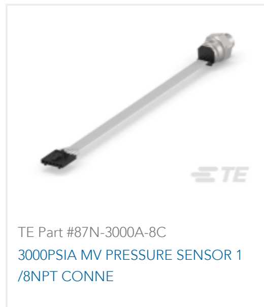
TE Part #87N-3000A-8C 3000PSIA MV PRESSURE SENSOR 1 /8NPT CONNE