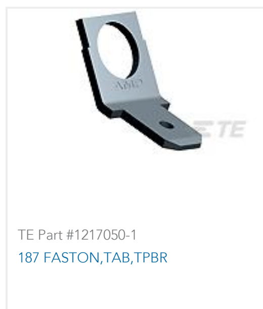
TE Part #1217050-1 187 FASTON,TAB,TPBR