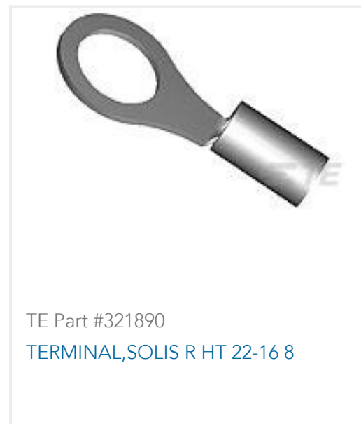
TE Part #321890 TERMINAL,SOLIS R HT 22-16 8