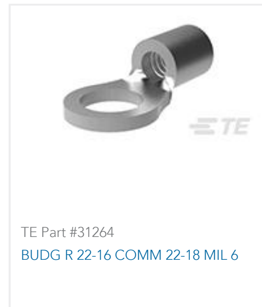
TE Part #31264 BUDG R 22-16 COMM 22-18 MIL 6