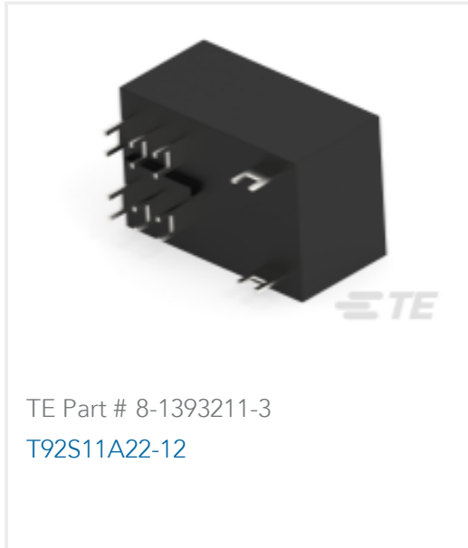
TE Part # 8-1393211-3 T92S11A22-12