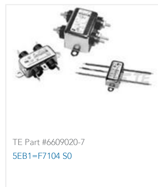
TE Part #6609020-7 5EB1=F7104 S0