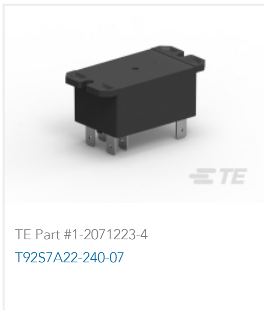
TE Part #1-2071223-4 T92S7A22-240-07