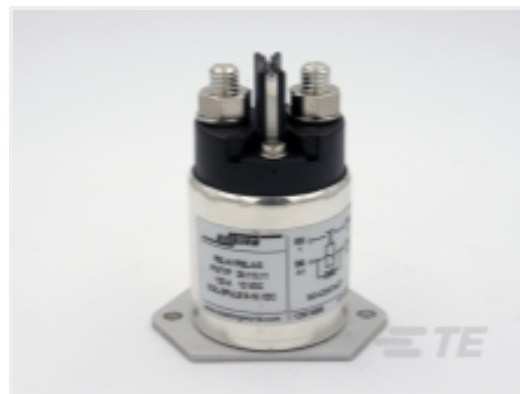
TE Part #K1060489 Relay 29-113-12