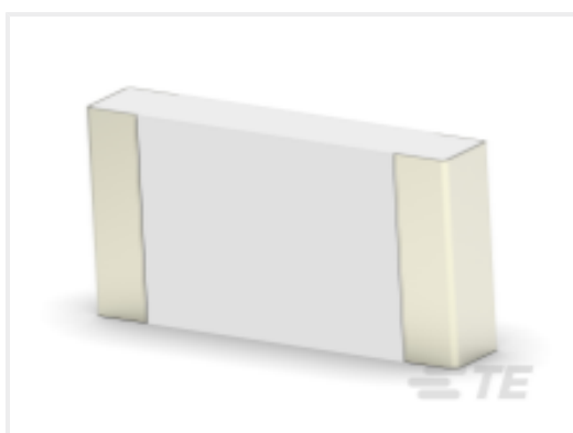
TE Part #2-2176245-2 CRGS1206 5% 56R