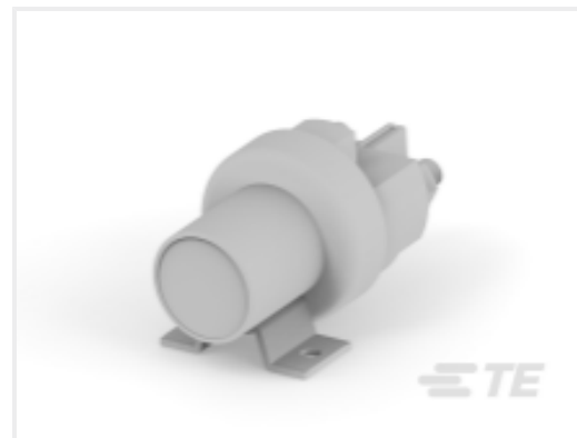
TE Part #K1008699 Relay 26-60-05