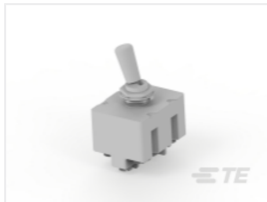
TE Part #K1002956 Toggle Switch 08-4-1-13