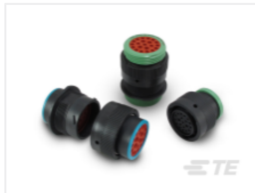
TE Part #CAT-H396-CH8172 DEUTSCH HDP20 Housings