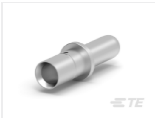
TE Part #SRK-PC-080-25-601 PIN, SOLID, SIZE M8, 25mm2, AG