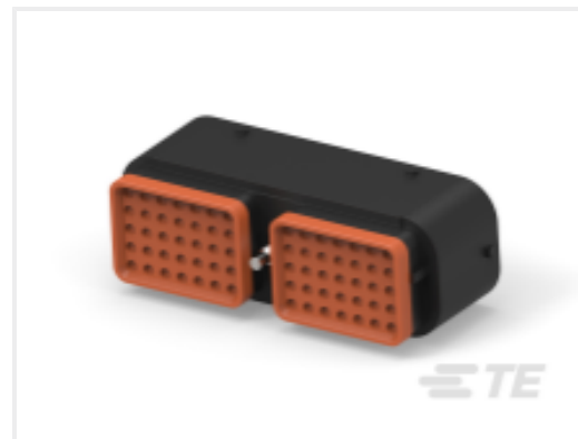
TE Part #DRC16-70SBE-P013UK PLG, 70P, BLK, E, SEAL BOND, B