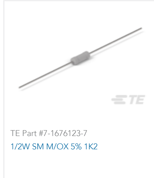
TE Part #7-1676123-7 1/2W SM M/OX 5% 1K2