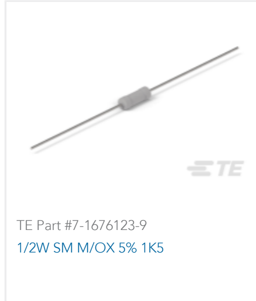
TE Part #7-1676123-9 1/2W SM M/OX 5% 1K5