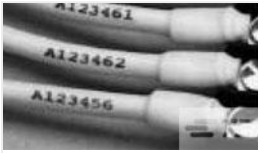
TE Part #5054324002 RNF-100-1-1/2-3-SP