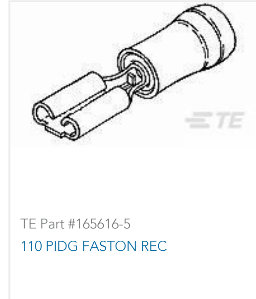
TE Part #165616-5 110 PIDG FASTON REC