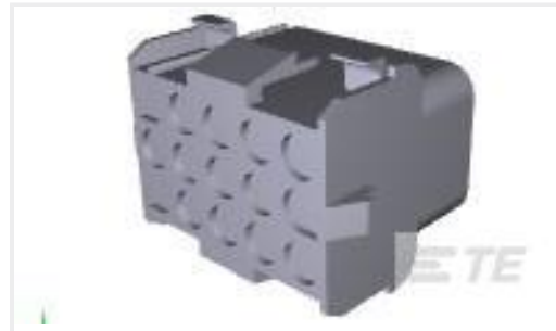
TE Part #926647-2 15P UN-MNL AUFN-GEH