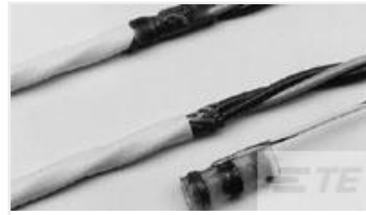
TE Part #625250-000 D-128-0008