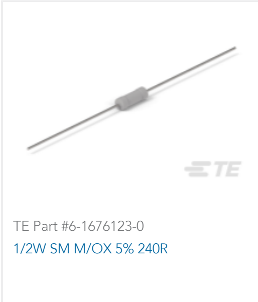
TE Part #6-1676123-0 1/2W SM M/OX 5% 240R