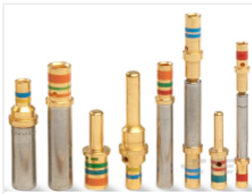
TE Part #100503L CONT SOC ASSY