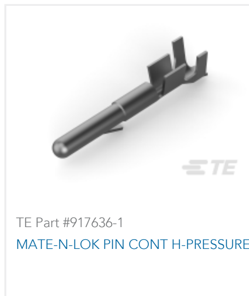
TE Part #917636-1 MATE-N-LOK PIN CONT H-PRESSURE