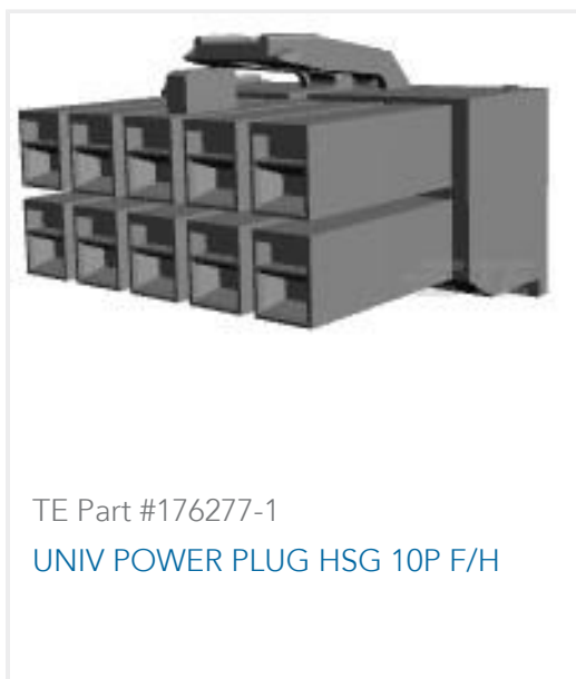
TE Part #176277-1 UNIV POWER PLUG HSG 10P F/H