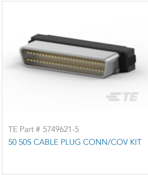
TE Part # 5749621-5 50 50S CABLE PLUG CONN/COV KIT