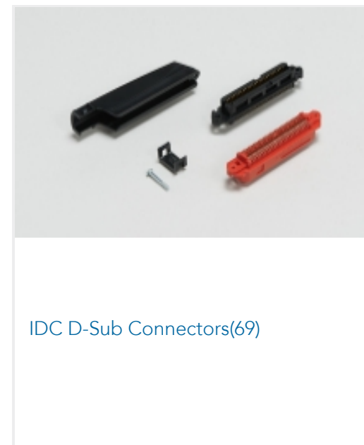
IDC D-Sub Connectors(69)