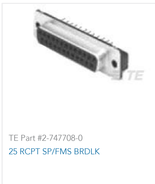
TE Part #2-747708-0 25 RCPT SP/FMS BRDLK