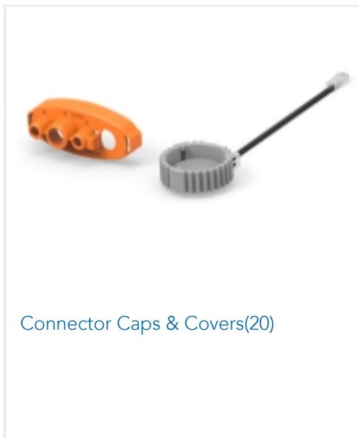
Connector Caps & Covers(20)