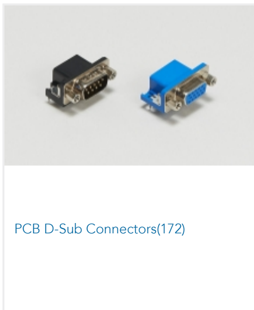
PCB D-Sub Connectors(172)