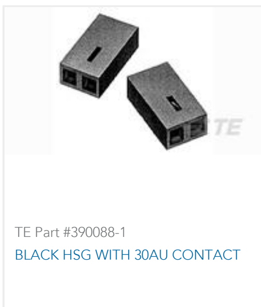
TE Part #390088-1 BLACK HSG WITH 30AU CONTACT