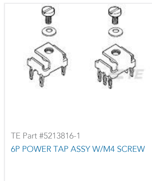
TE Part #5213816-1 6P POWER TAP ASSY W/M4 SCREW