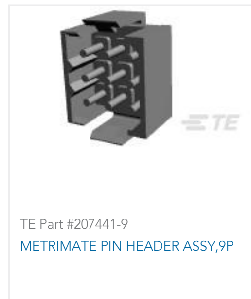
TE Part #207441-9 METRIMATE PIN HEADER ASSY,9P