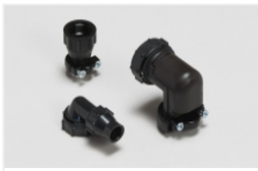
Circular Connector Backshells & Clamps(5)