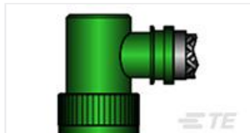
TE Part #730145-000 208M918-19B12