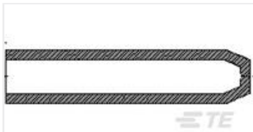
TE Part #470353-001 SSC-3/239