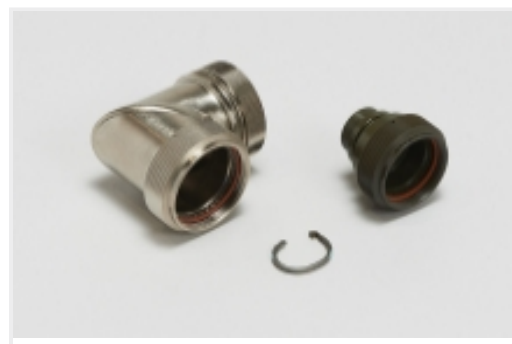
Screened Backshells & Adapters(5)