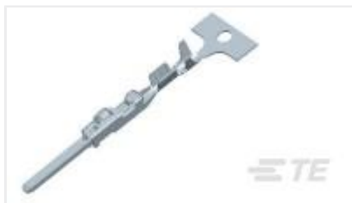
TE Part #1718350-1 MCON 1.2 CB TAB STC SN