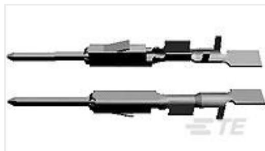
TE Part #6-928918-1 MQS0,63 Sn tab LL unseal. 0,2-0,35