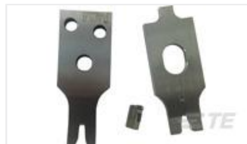
TE Part #7-2151061-7 OCEAN_2.0_SPARE_PART_KIT-080F1100