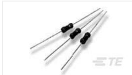
TE Part # 1625881-2 1W STD M/OX 2% 220R