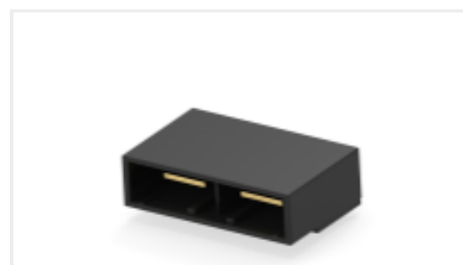
TE Part #1-2351965-2 Dynamic D8000 HDR ASSY 2PX BLK