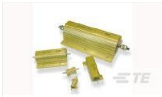
TE Part #1-1625999-1 HSC100 1K2 5%