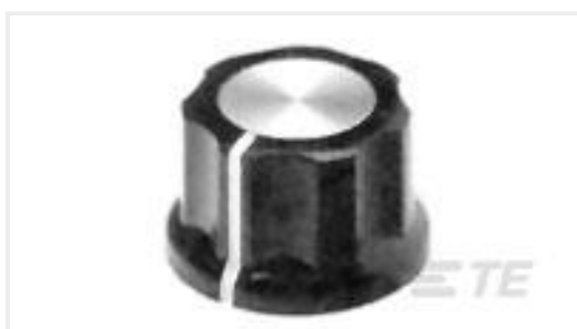
TE Part #5-1437624-3 PKES90B1/4=KNOB PLSTC FLUTED W