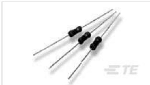
TE Part # 1625893-5 5W SM M/OX 5% 47K