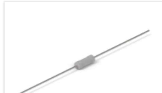
TE Part # 6-1676123-7 1/2W SM M/OX 5% 470R