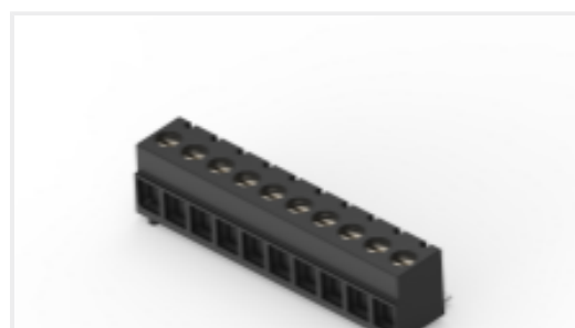
TE Part #1-2383945-0 TERMI-BLOK SMD MOUNT 180_10P_3.81MM 12A