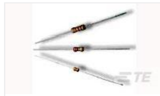
TE Part #4-1623931-0 CFR25 5% 4M7