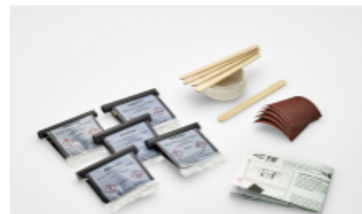
TE Part #878462-000 S1125-KIT-1