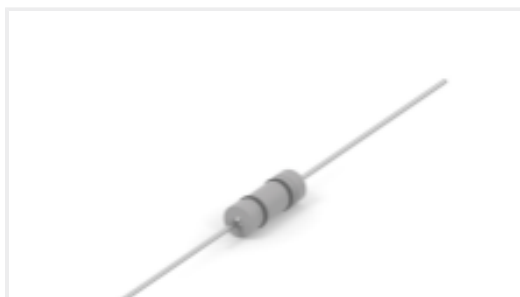
TE Part # 4-1625886-1 1W SM M/OX 5% 820K