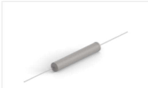
TE Part #7-2176416-4 9W STD M/OX 5% 56K