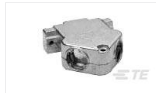
TE Part #1534805-1 HD20 COVER KIT 9POS WITH CABLE