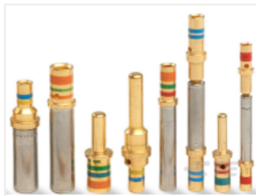
TE Part #2562-201-2031L CONT SOC ASSY