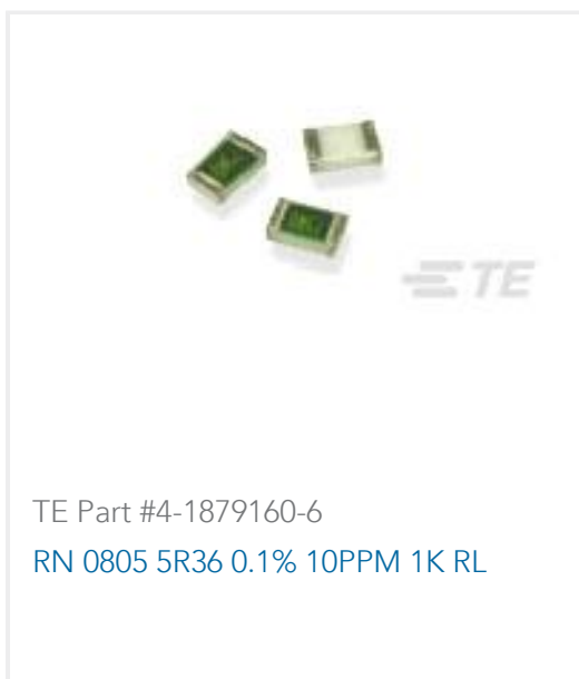
TE Part #4-1879160-6 RN 0805 5R36 0.1% 10PPM 1K RL