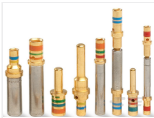
TE Part #2560-201-2031L CONT PIN