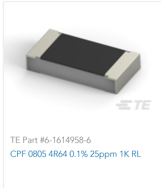
TE Part #6-1614958-6 CPF 0805 4R64 0.1% 25ppm 1K RL