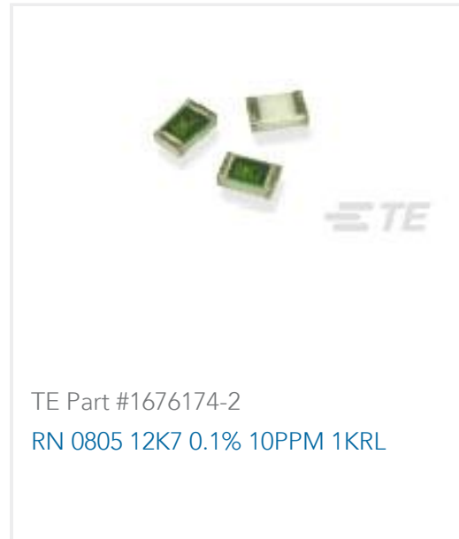
TE Part #1676174-2 RN 0805 12K7 0.1% 10PPM 1KRL