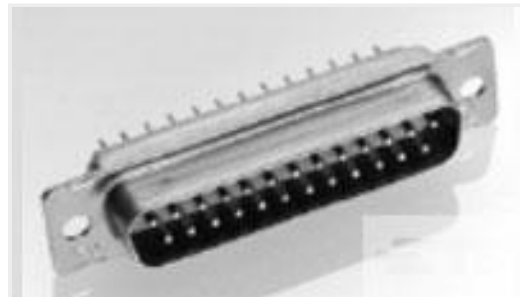
TE Part #206799-2 RECEPT ASSY, 15 POSN, AMPLIMITE