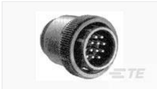
TE Part #206305-1 CPC PLUG ASSEMBLY SIZE 23-37