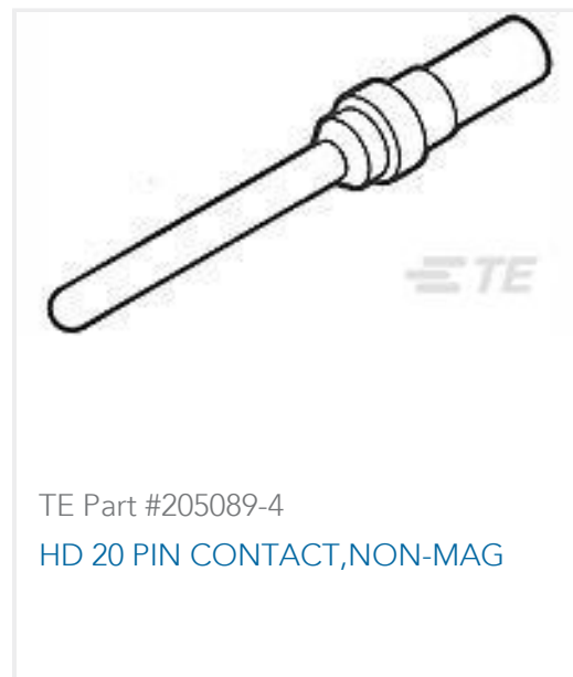
TE Part #205089-4 HD 20 PIN CONTACT, NON-MAG