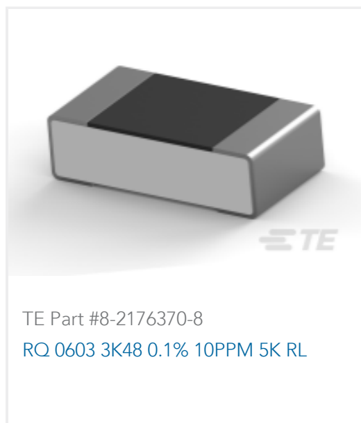
TE Part #8-2176370-8 RQ 0603 3K48 0.1% 10PPM 5K RL