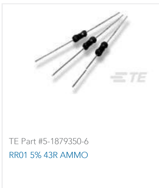
TE Part #5-1879350-6 RR01 5% 43R AMMO