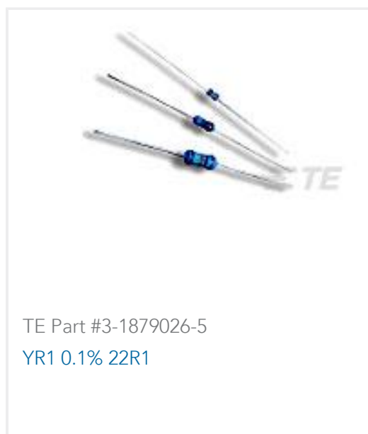
TE Part #3-1879026-5 YR1 0.1% 22R1