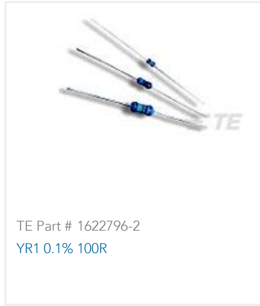
TE Part # 1622796-2 YR1 0.1% 100R