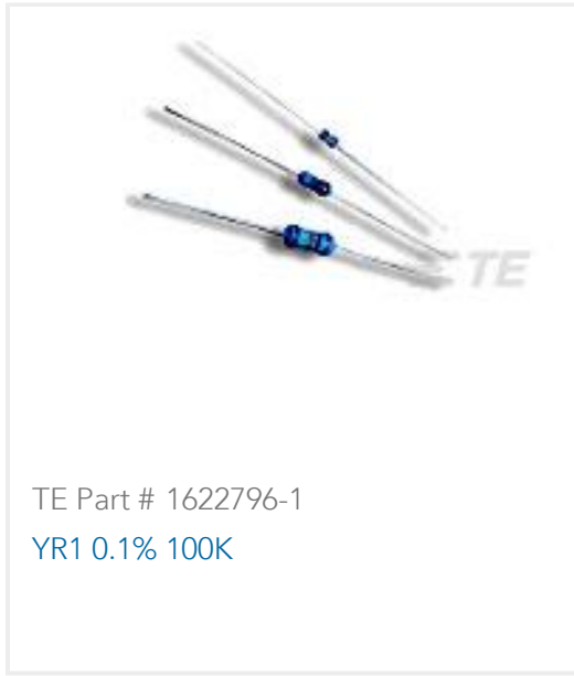
TE Part # 1622796-1 YR1 0.1% 100K