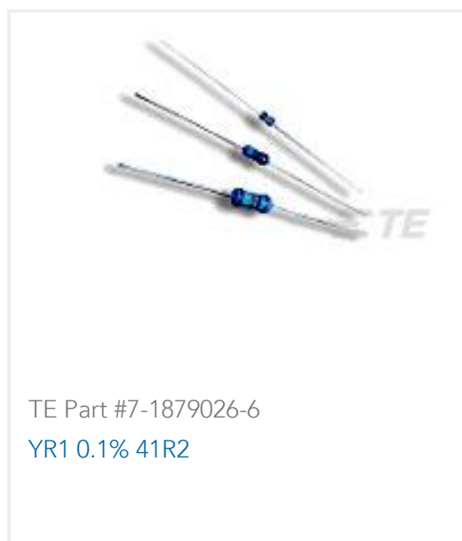
TE Part #7-1879026-6 YR1 0.1% 41R2