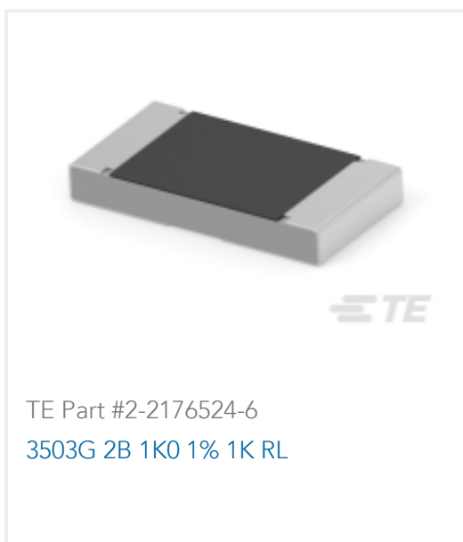
TE Part #2-2176524-6 3503G 2B 1K0 1% 1K RL