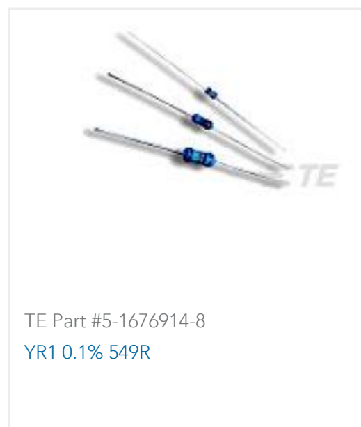
TE Part #5-1676914-8 YR1 0.1% 549R