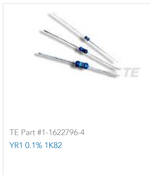
TE Part #1-1622796-4 YR1 0.1% 1K82