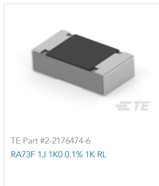
TE Part #2-2176474-6 RA73F 1J 1K0 0.1% 1K RL