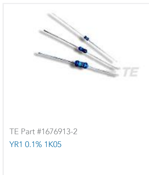
TE Part #1676913-2 YR1 0.1% 1K05