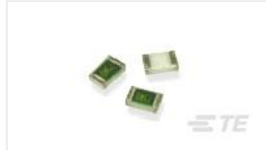
TE Part #8-1625868-5 RP 2A 0.25W 40R2 0.1% 25PPM 1K RL