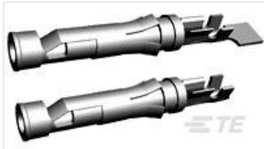
TE Part #1-66101-9 III+ SKT, 18-16, TIN ,LP