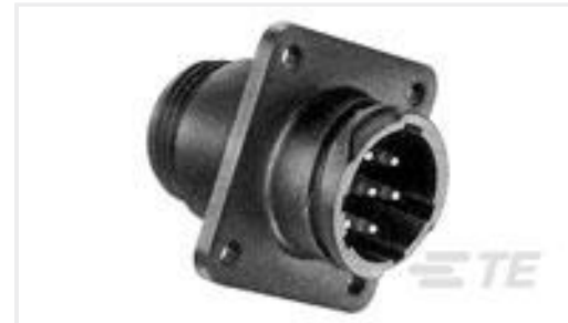
TE Part #211401-3 RECEPT, SZ 13-7, CPC