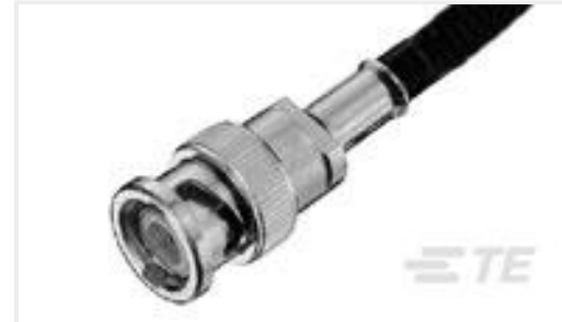
TE Part #2-5330061-1 BNC PLUG