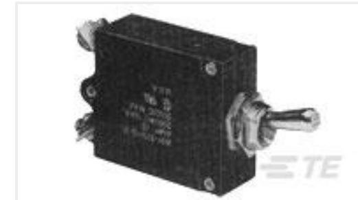
TE Part #3-1393247-5 W31-X2M1G-20=W23/W31