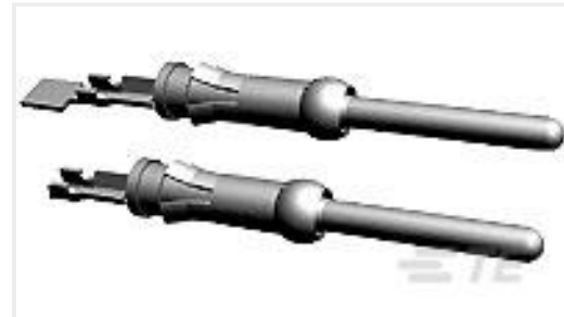
TE Part #1-66359-7 III+ PIN, 18-14, TIN-LEAD, STRIP