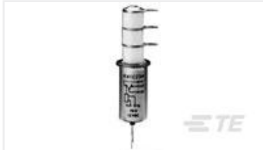
TE Part #5-1618239-0 K41C334=RELAY, VACUUM, SPDT