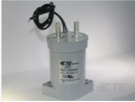
TE Part # 7-1618387-1 LEV200A5ANA=RELAY, SPST-NO