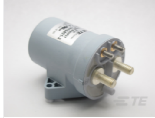
TE Part # 5-1618388-7 LEV200A6ANF=RELAY, SPST-NO