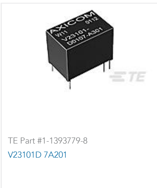
TE Part #1-1393779-8 V23101D 7A201