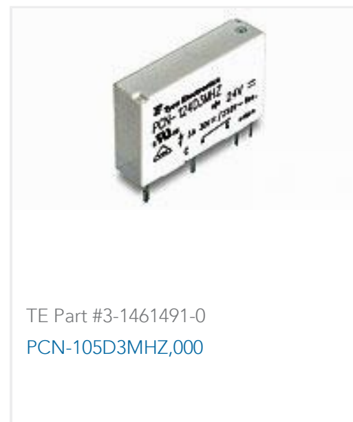
TE Part #3-1461491-0 PCN-105D3MHZ,000