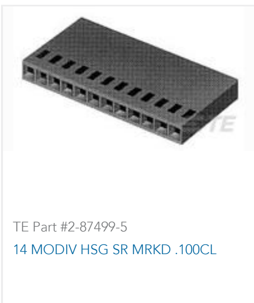
TE Part #2-87499-5 14 MODIV HSG SR MRKD .100CL