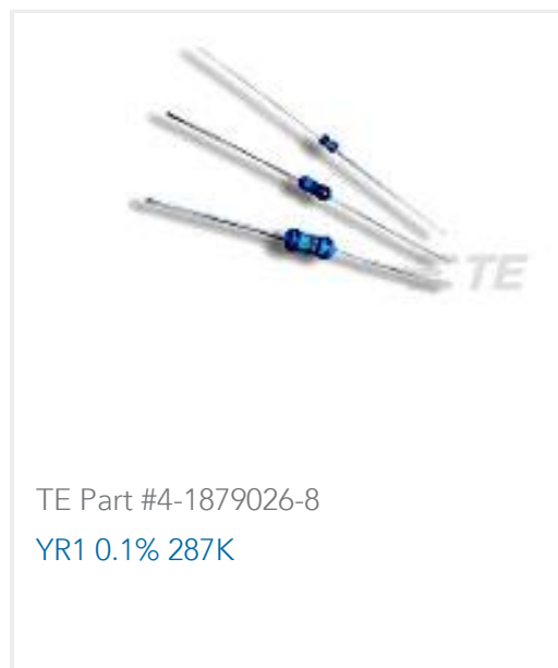
TE Part #4-1879026-8 YR1 0.1% 287K