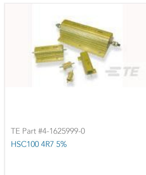
TE Part #4-1625999-0 HSC100 4R7 5%