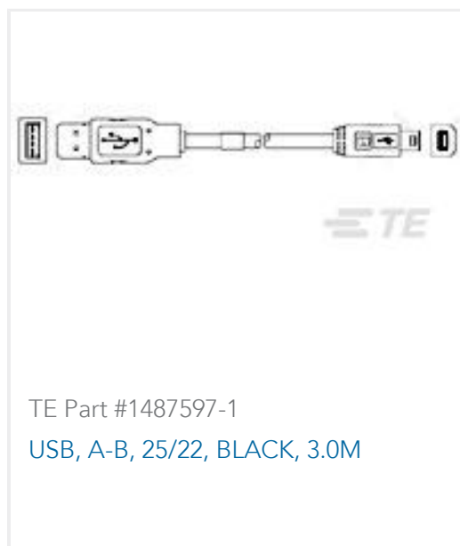
TE Part #1487597-1 USB, A-B, 25/22, BLACK, 3.0M