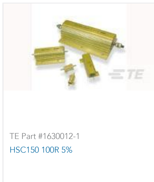
TE Part #1630012-1 HSC150 100R 5%