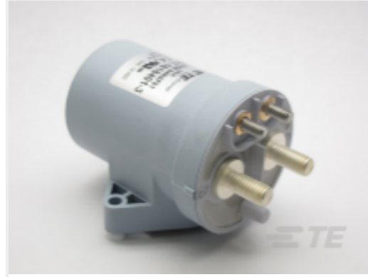
TE Part # 8-1618401-9 LEV200L5ANF=Contactor, SPST-NO w /aux