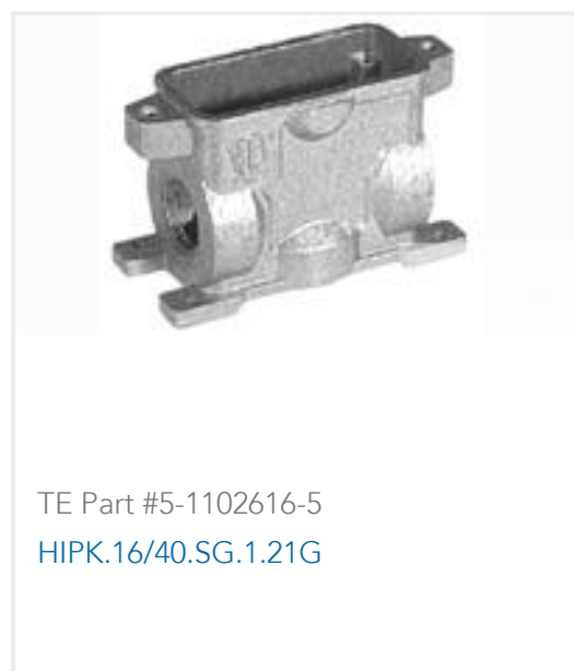
TE Part #5-1102616-5 HIPK.16/40.SG.1.21G