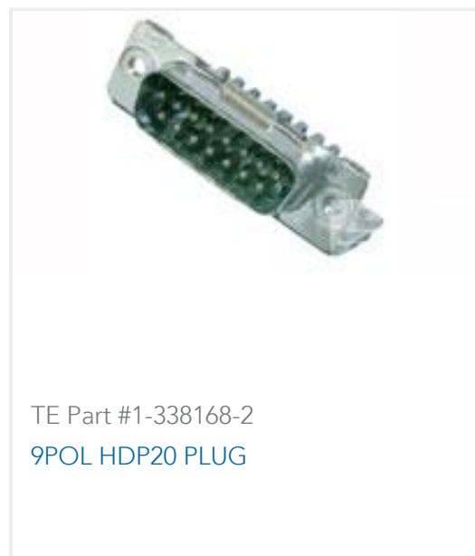
TE Part #1-338168-2 9POL HDP20 PLUG