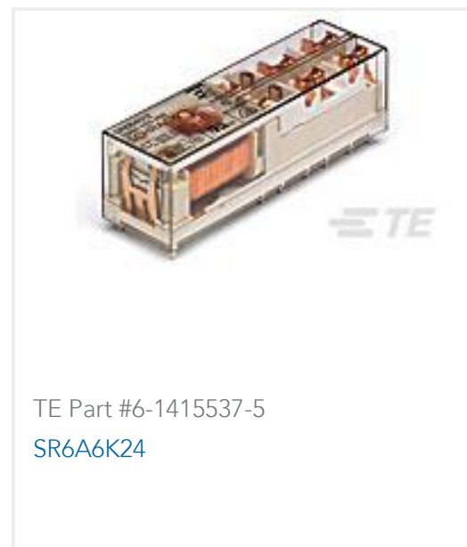
TE Part #6-1415537-5 SR6A6K24