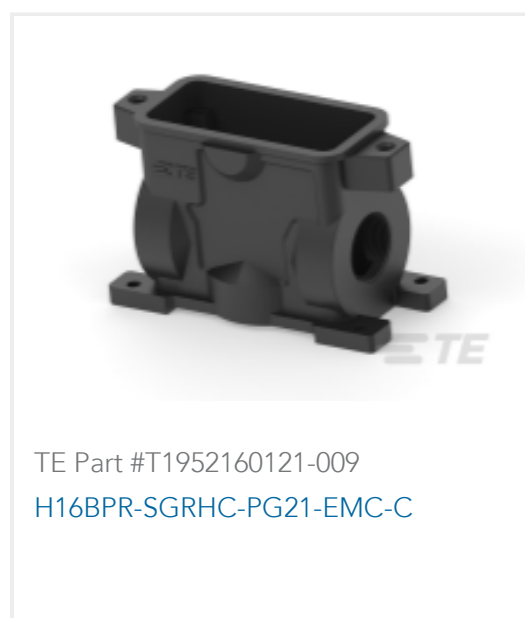
TE Part #T1952160121-009 H16BPR-SGRHC-PG21-EMC-C