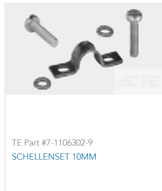
TE Part #7-1106302-9 SCHELLENSET 10MM