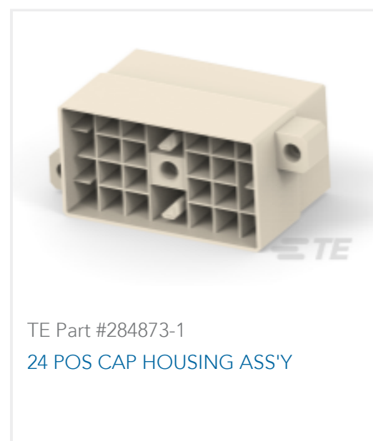
TE Part #284873-1 24 POS CAP HOUSING ASS'Y