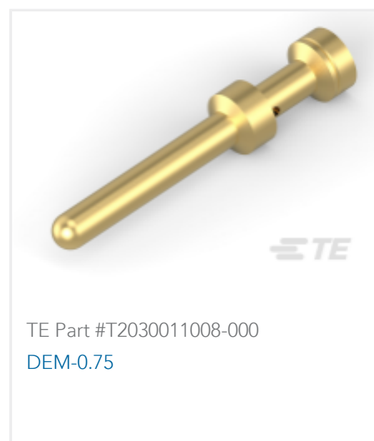
TE Part #T2030011008-000 DEM-0.75