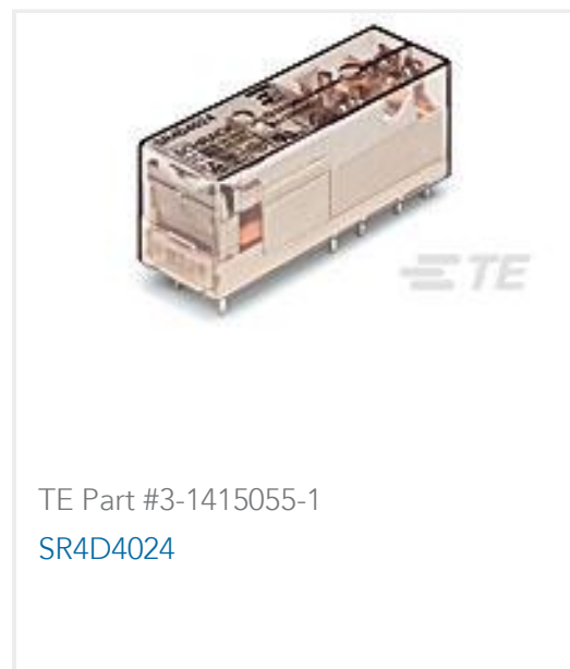
TE Part #3-1415055-1 SR4D4024