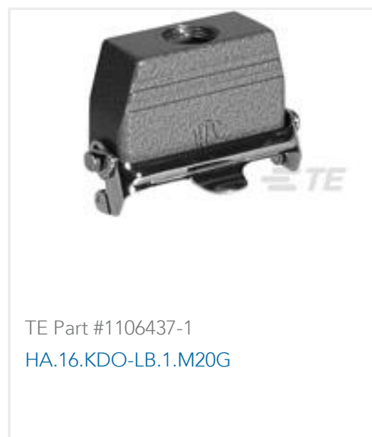
TE Part #1106437-1 HA.16.KDO-LB.1.M20G