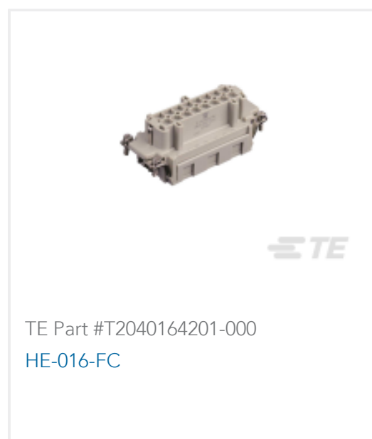
TE Part #T2040164201-000 HE-016-FC