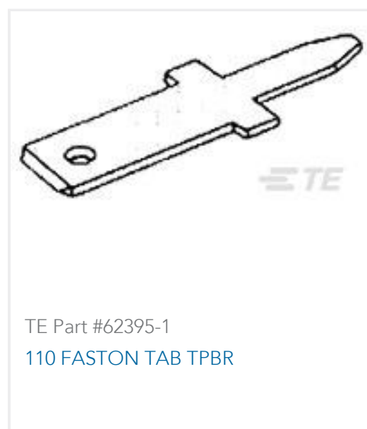
TE Part #62395-1 110 FASTON TAB TPBR