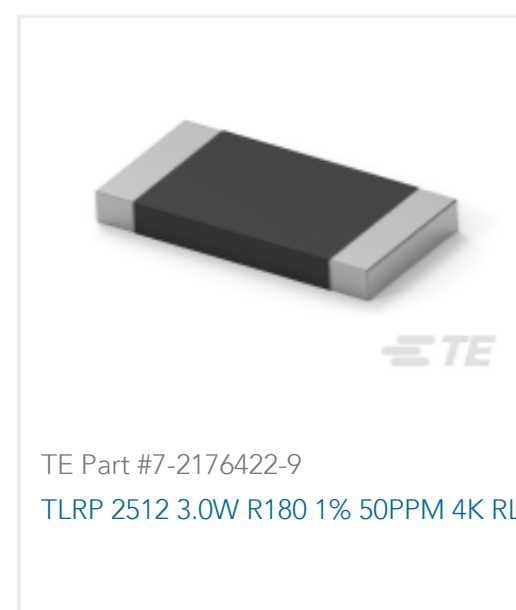
TE Part #7-2176422-9 TLRP 2512 3.0W R180 1% 50PPM 4K RL