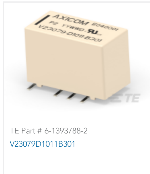
TE Part # 6-1393788-2 V23079D1011B301