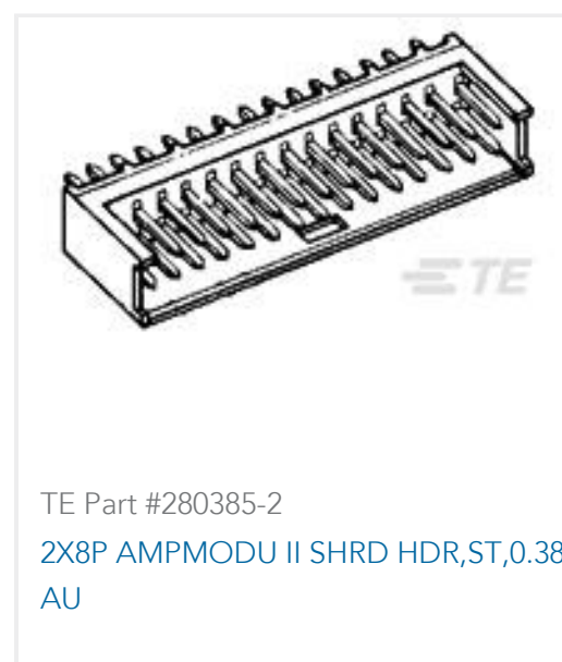
TE Part #280385-2 2X8P AMPMODU II SHRD HDR,ST,0.38 AU