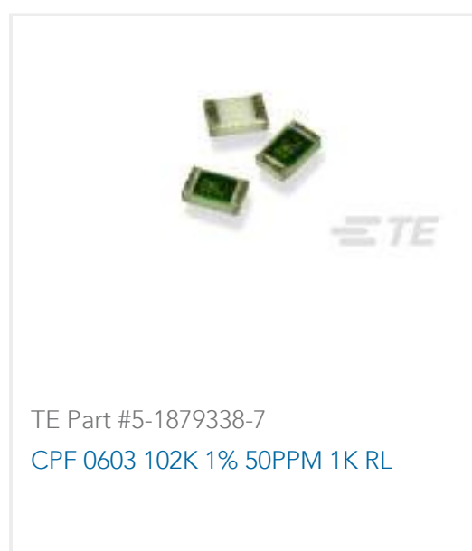
TE Part #5-1879338-7 CPF 0603 102K 1% 50PPM 1K RL