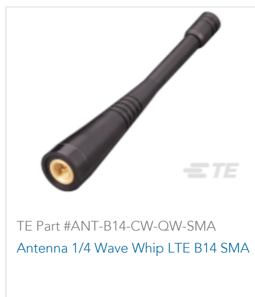
TE Part #ANT-B14-CW-QW-SMA Antenna 1/4 Wave Whip LTE B14 SMA