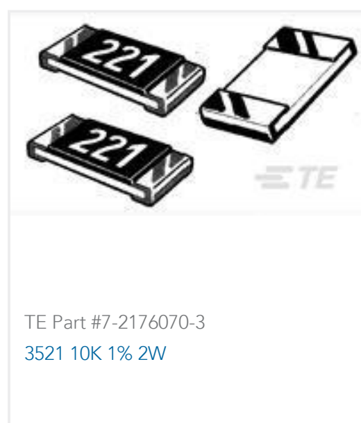
TE Part #7-2176070-3 3521 10K 1% 2W