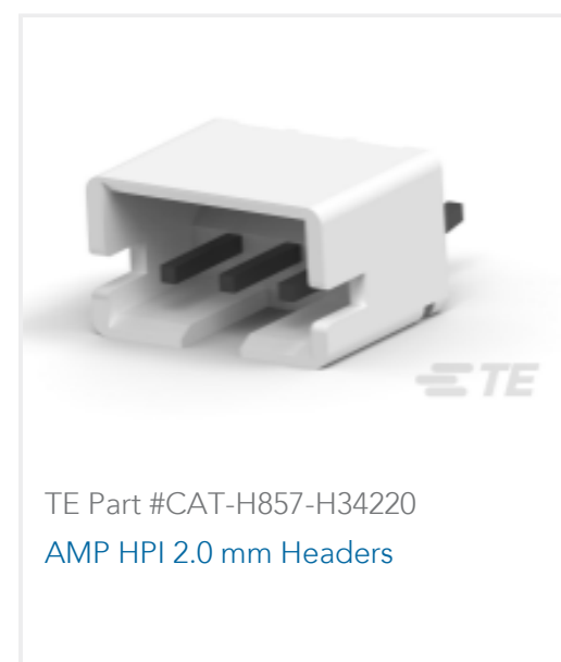
TE Part #CAT-H857-H34220 AMP HPI 2.0 mm Headers