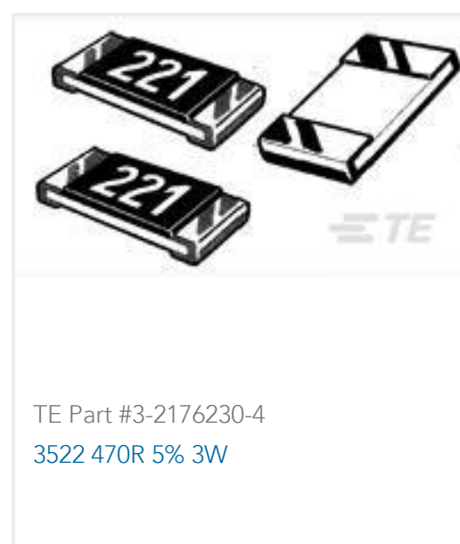
TE Part #3-2176230-4 3522 470R 5% 3W