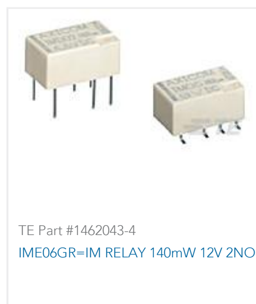
TE Part #1462043-4 IME06GR=IM RELAY 140mW 12V 2NO