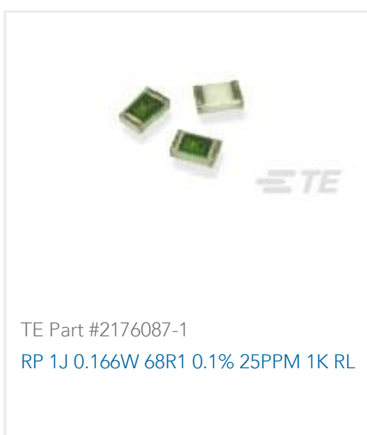
TE Part #2176087-1 RP 1J 0.166W 68R1 0.1% 25PPM 1K RL