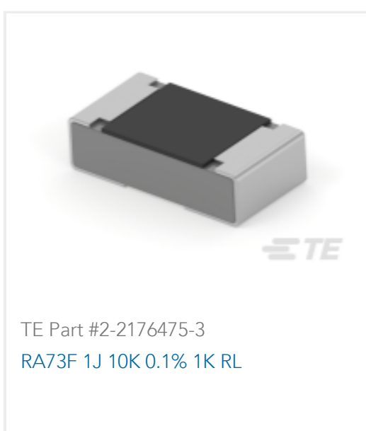
TE Part #2-2176475-3 RA73F 1J 10K 0.1% 1K RL