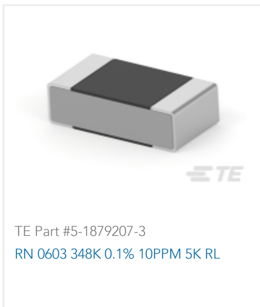
TE Part #5-1879207-3 RN 0603 348K 0.1% 10PPM 5K RL