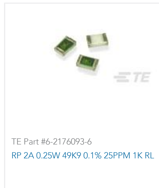
TE Part #6-2176093-6 RP 2A 0.25W 49K9 0.1% 25PPM 1K RL