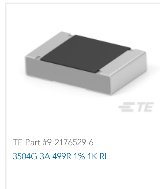
TE Part #9-2176529-6 3504G 3A 499R 1% 1K RL