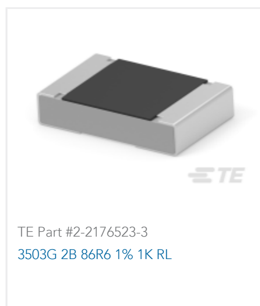
TE Part #2-2176523-3 3503G 2B 86R6 1% 1K RL