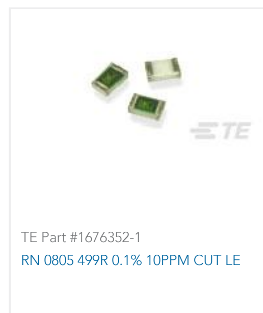
TE Part #1676352-1 RN 0805 499R 0.1% 10PPM CUT LE