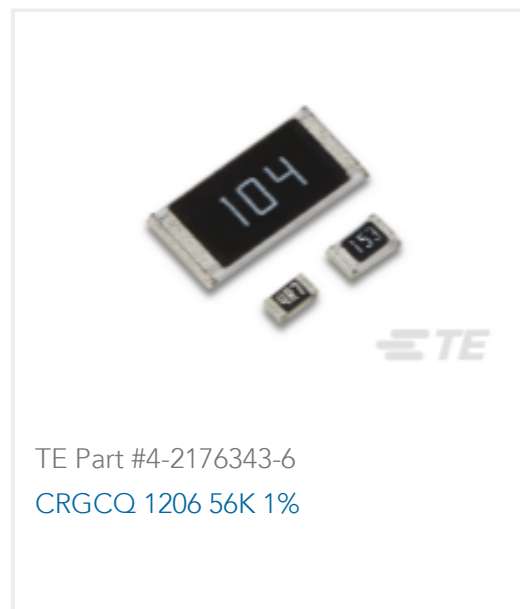
TE Part #4-2176343-6 CRGCO 1206 56K 1%