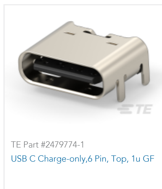
TE Part #2479774-1 USB C Charge-only,6 Pin, Top, 1u GF