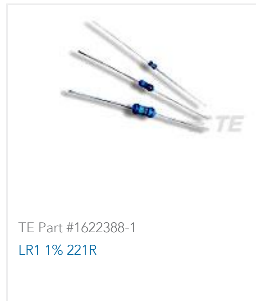
TE Part #1622388-1 LR1 1% 221R