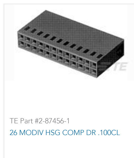
TE Part #2-87456-1 26 MODIV HSG COMP DR .100CL