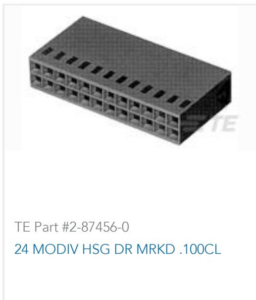
TE Part #2-87456-0 24 MODIV HSG DR MRKD .100CL