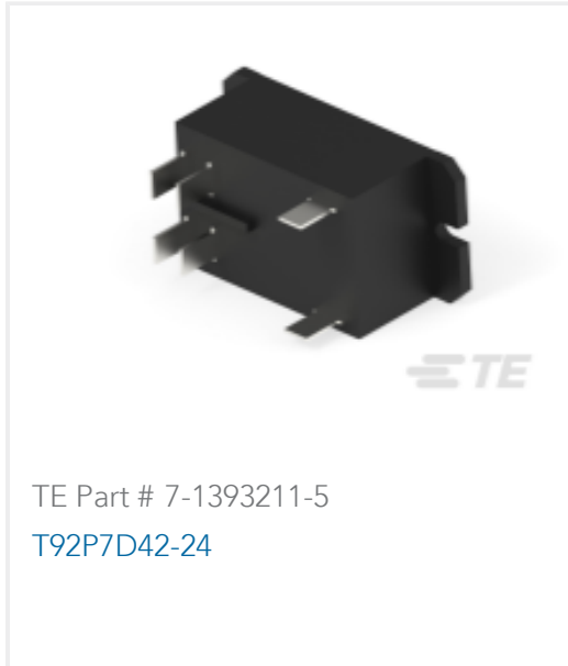
TE Part # 7-1393211-5 T92P7D42-24