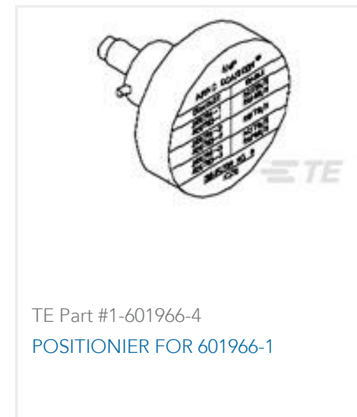
TE Part #1-601966-4 POSITIONIER FOR 601966-1