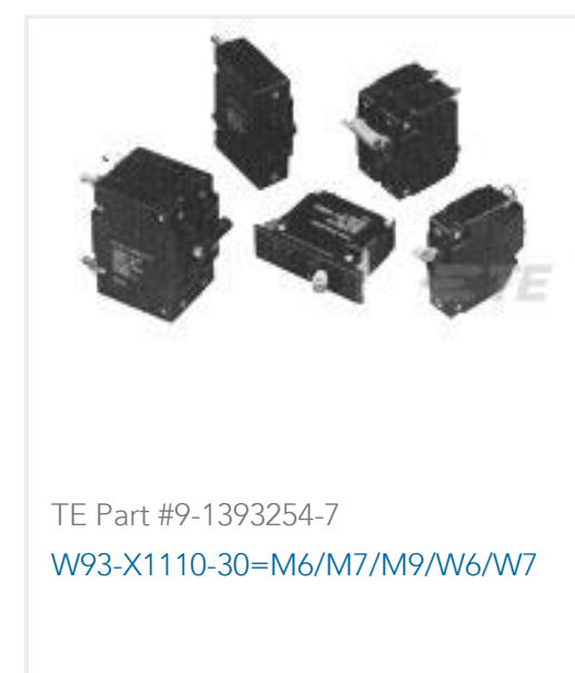
TE Part #9-1393254-7 W93-X1110-30=M6/M7/M9/W6/W7