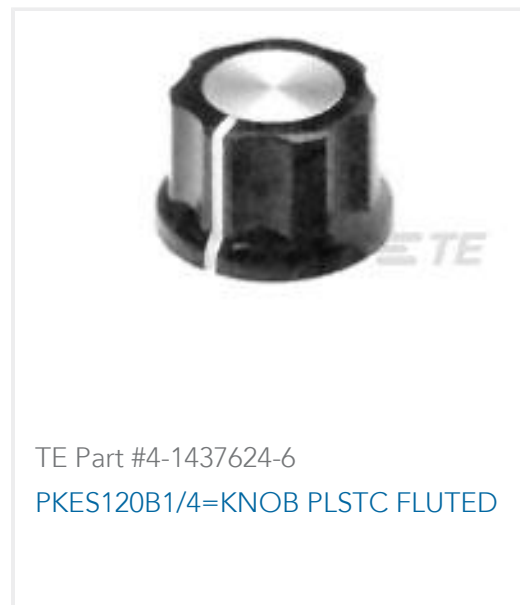
TE Part #4-1437624-6 PKES120B1/4=KNOB PLSTC FLUTED