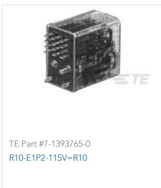
TE Part #7-1393765-0 R10-E1P2-115V=R10