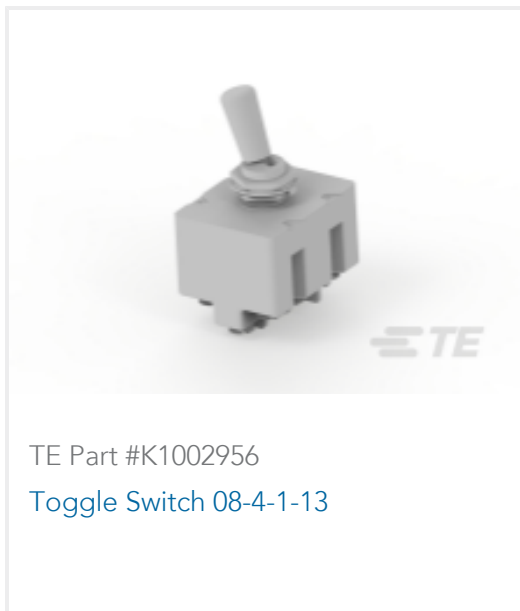
TE Part #K1002956 Toggle Switch 08-4-1-13