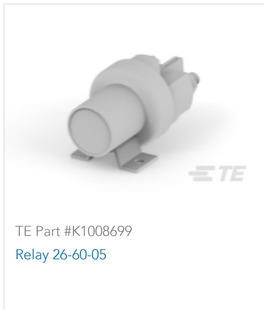
TE Part #K1008699 Relay 26-60-05