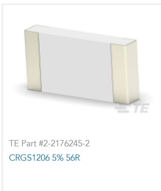
TE Part #2-2176245-2 CRGS1206 5% 56R