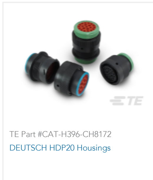
TE Part #CAT-H396-CH8172 DEUTSCH HDP20 Housings