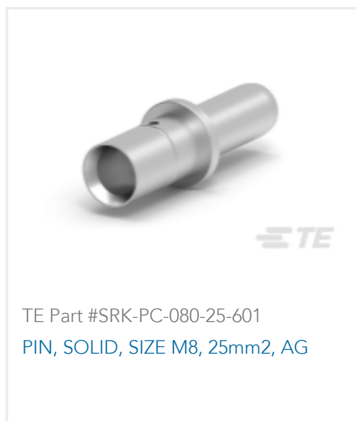
TE Part #SRK-PC-080-25-601 PIN, SOLID, SIZE M8, 25mm2, AG