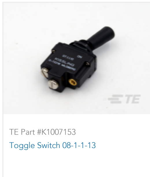
TE Part #K1007153 Toggle Switch 08-1-1-13