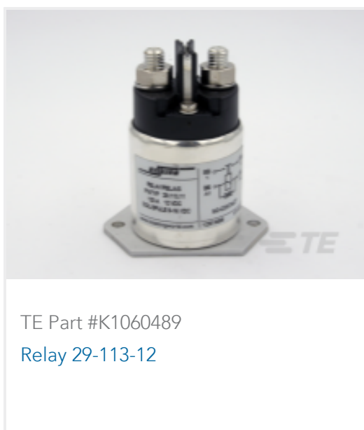
TE Part #K1060489 Relay 29-113-12