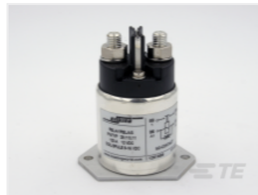
TE Part #K1060489 Relay 29-113-12