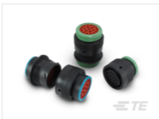
TE Part #CAT-H396-CH8172 DEUTSCH HDP20 Housings