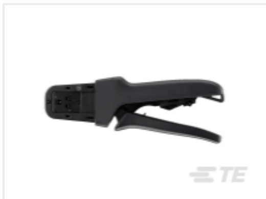
TE Part #DTT-20-03 CRIMP TOOL