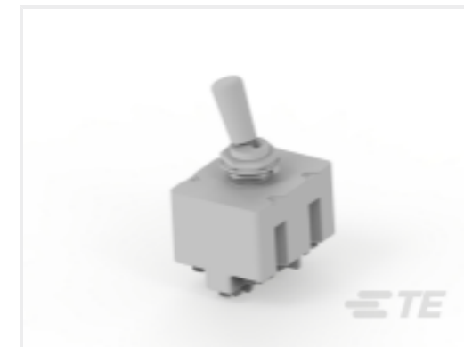
TE Part #K1002956 Toggle Switch 08-4-1-13