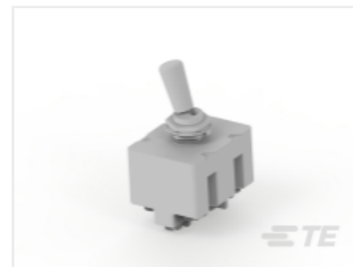
TE Part #K1002956 Toggle Switch 08-4-1-13