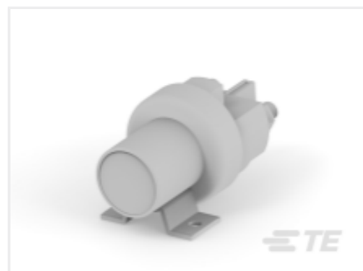
TE Part #K1008699 Relay 26-60-05