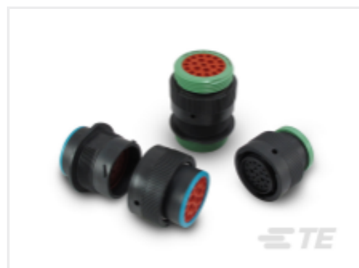
TE Part #CAT-H396-CH8172 DEUTSCH HDP20 Housings