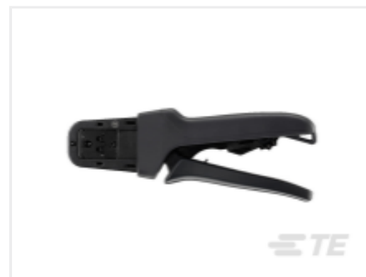
TE Part #DTT-20-03 CRIMP TOOL