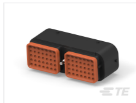
TE Part #DRC16-70SBE-P013UK PLG, 70P, BLK, E, SEAL BOND, B