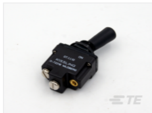
TE Part #K1007153 Toggle Switch 08-1-1-13