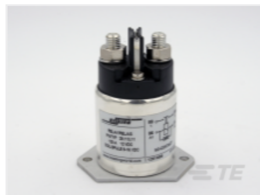
TE Part #K1060489 Relay 29-113-12