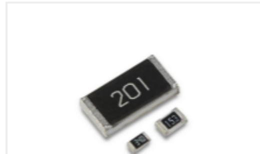
TE Part #3-2176325-7 CRGP 0402 10K 1%