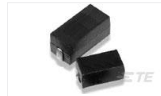
TE Part #3-1879233-7 SMW5 3R3 5%