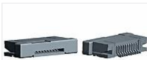
TE Part #2-1734592-6 FPC CONN. 0.5MM PITCH B/C, 26P