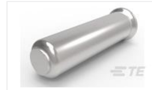
TE Part #1-5332095-9 SOCKET,MIN-SPR W/KO SN-AU S-1