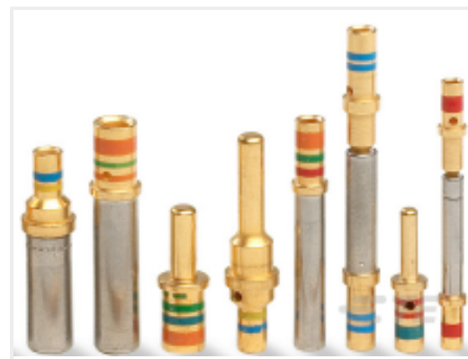
TE Part #2562-201-2031L CONT SOC ASSY