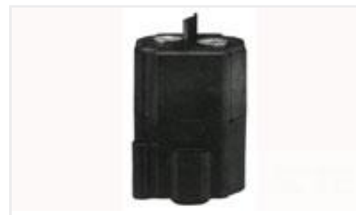
TE Part #2-1618002-6 EV250-2B=RELAY, 24VDC SPST-NO