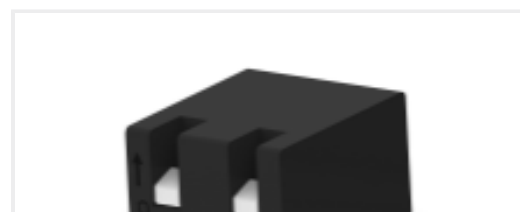
TE Part #5-2319764-6 E STACK PIANO 2P G SHORT SEAL T&R PD OFF