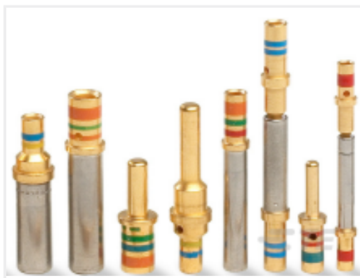
TE Part #2560-201-2031L CONT PIN