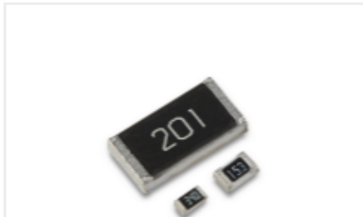
TE Part #1-2176325-7 CRGP 0402 220R 1%