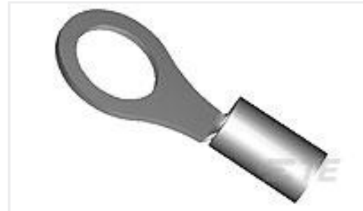
TE Part #322695 TERMINAL,STRATO-THERM R HR 16-14 10