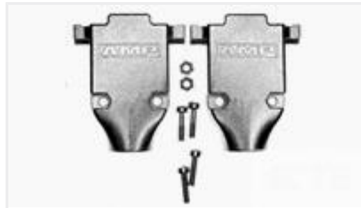
TE Part #5748676-4 DIE CAST CBL CLMP KIT,SZ 4