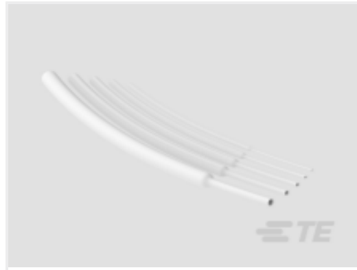
TE Part #CAT-HST-RNF100-2 RNF-100-2 Heat Shrink Tubing