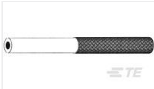
TE Part #D209003001 RAY-103-7.5(100)