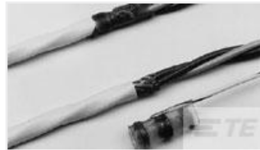
TE Part #482943-000 SO63-4-9030