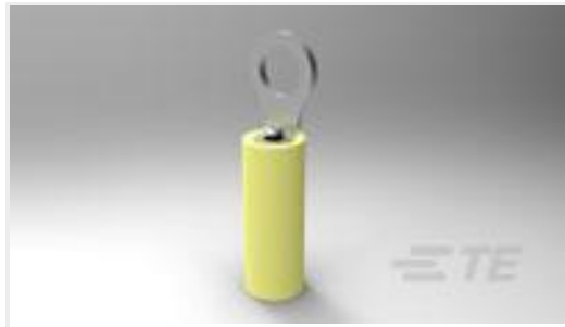
TE Part #323913 TERMINAL,PIDG R 26-22 2