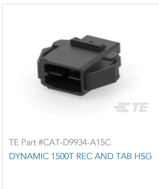
TE Part #CAT-D9934-A15C DYNAMIC 1500T REC AND TAB HSG