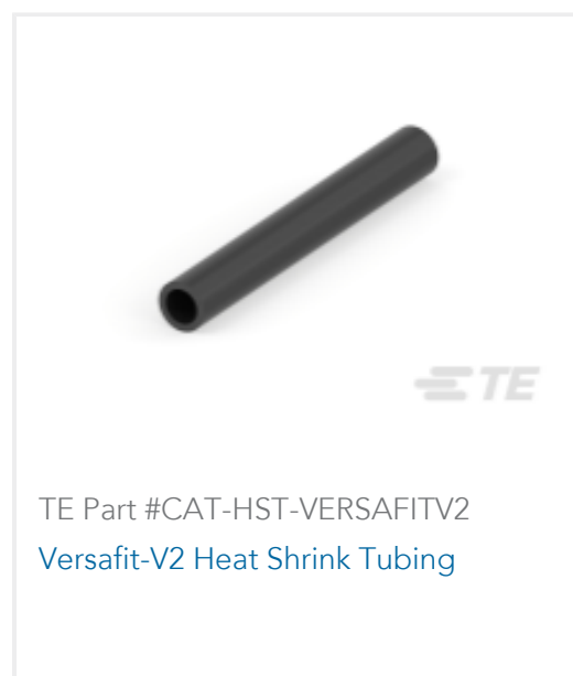
TE Part #CAT-HST-VERSAFITV2 Versafit-V2 Heat Shrink Tubing