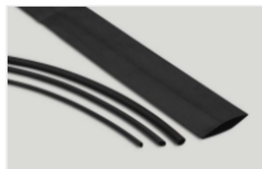
Single Wall Tubing(37)