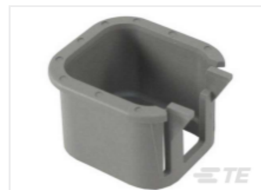
TE Part #1011-047-0605 SEAL RET, 6P, GRY, DTM