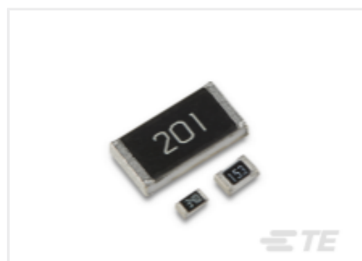
TE Part #2176329-2 CRGP 1210 12R 1%