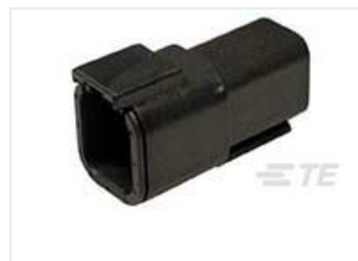
TE Part #DTM04-6P-EE04 REC, 6P, BLK, N, HIGH TEMP