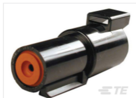
TE Part #DTHD04-1-12P REC, 1P, BLK, N, SIZE 12