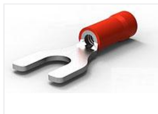
TE Part #34155 PG SPD 22-16 COMM 22-18 MIL 8