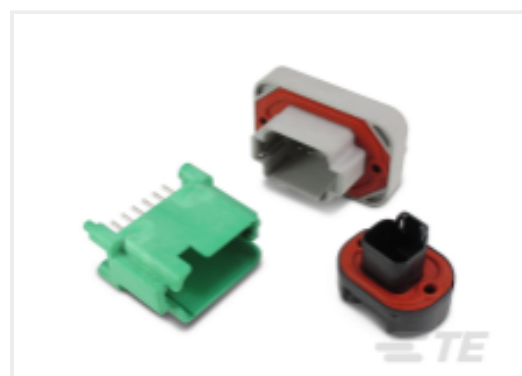
TE Part #CAT-D487-H342 DEUTSCH DT Headers