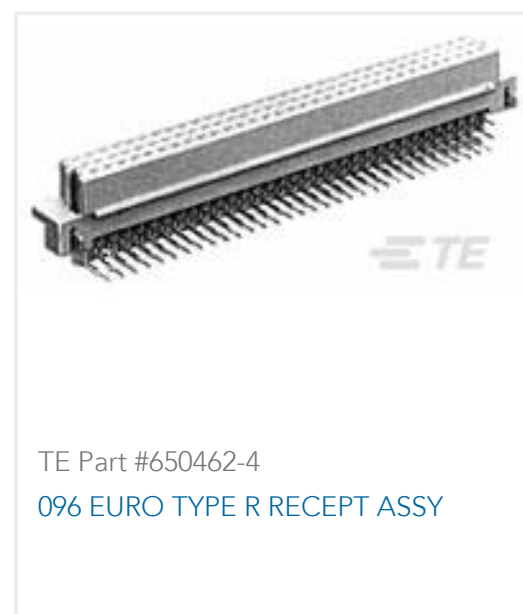
TE Part #650462-4 096 EURO TYPE R RECEPT ASSY