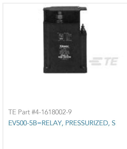
TE Part #4-1618002-9 EV500-5B=RELAY, PRESSURIZED, S