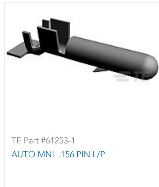
TE Part #61253-1 AUTO MNL .156 PIN L/P