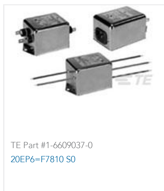
TE Part #1-6609037-0 20EP6=F7810 S0