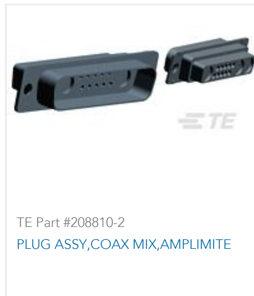
TE Part #208810-2 PLUG ASSY, COAX MIX, AMPLIMITE