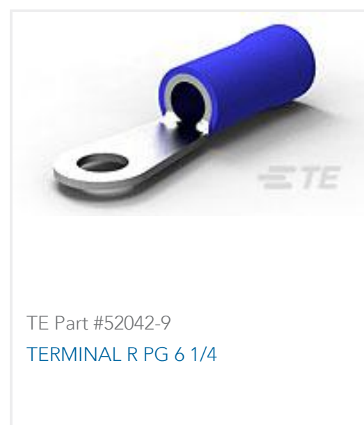
TE Part #52042-9 TERMINAL R PG 6 1/4