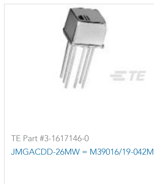
TE Part #3-1617146-0 JMGACDD-26MW = M39016/19-042M