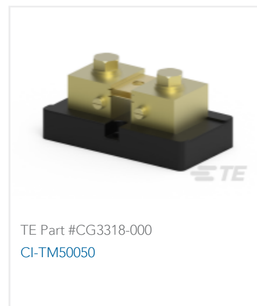
TE Part #CG3318-000 CI-TM50050