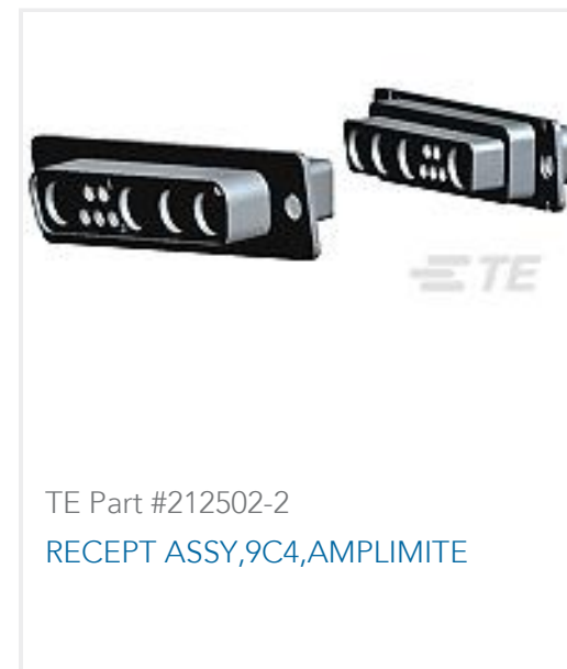
TE Part #212502-2 RECEPT ASSY, 9C4, AMPLIMITE