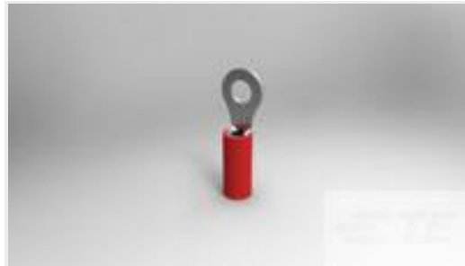
TE Part #130046 PIDG RING TONGUE