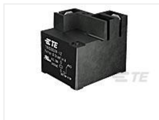
TE Part #5-1419102-4 T9AP5D52-12