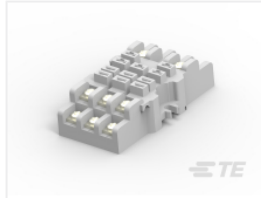
TE Part #1393143-5 27E121=SOCKET, KUP, 11, SCW, PLE