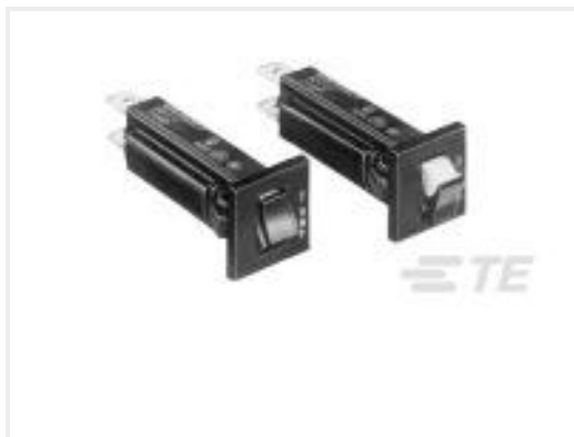
TE Part #3-1393250-9 W28-XQ1A-6=W28-