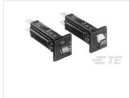
TE Part #3-1393250-4 W28-XQ1A-3=W28-