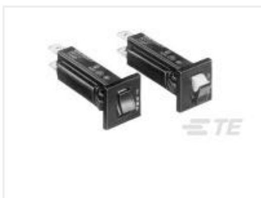
TE Part #3-1393250-0 W28-XQ1A-15=W28-