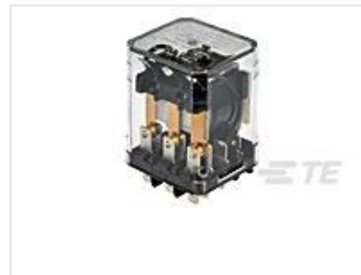
TE Part #8-1393117-0 KUP-14A15-240=KU