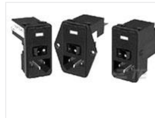
TE Part #6609929-4 PE0SXDHX A=C2218