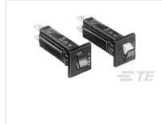
TE Part #2-1393250-5 W28-XQ1A-10=W28-