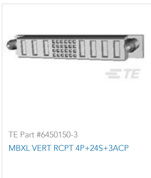
TE Part #6450150-3 MBXL VERT RCPT 4P+24S+3ACP