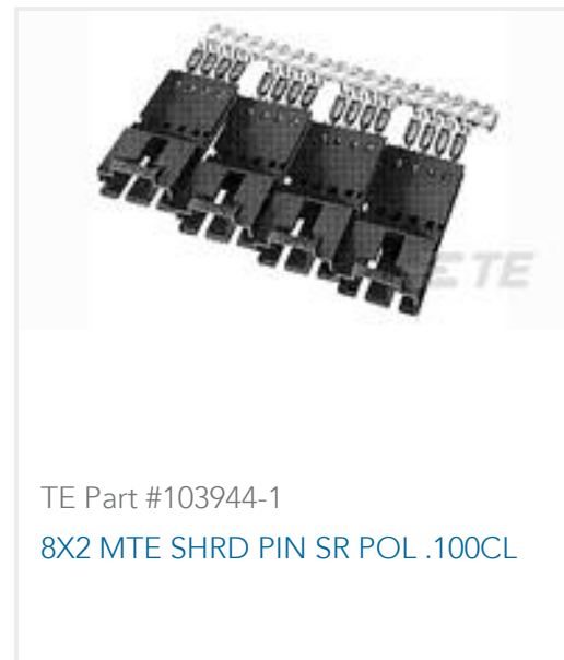
TE Part #103944-1 8X2 MTE SHRD PIN SR POL .100CL