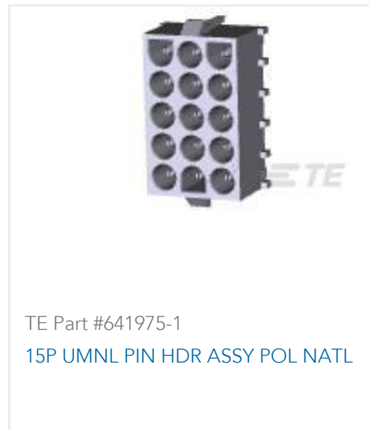
TE Part #641975-1 15P UMNL PIN HDR ASSY POL NATL