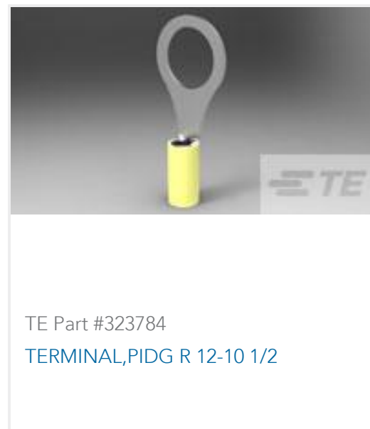
TE Part #323784 TERMINAL,PIDG R 12-10 1/2