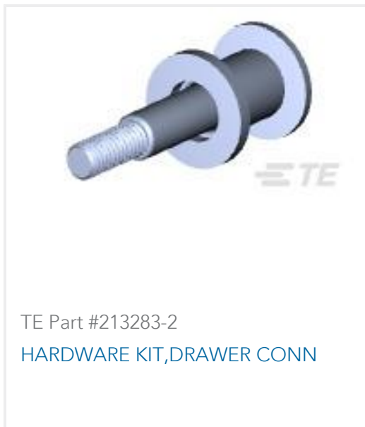
TE Part #213283-2 HARDWARE KIT,DRAWER CONN