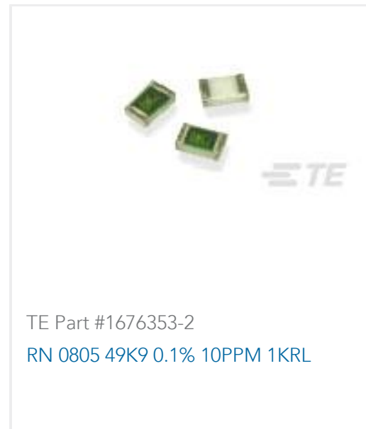
TE Part #1676353-2 RN 0805 49K9 0.1% 10PPM 1KRL