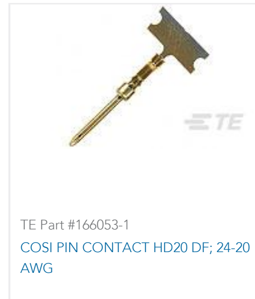
TE Part #166053-1 COSI PIN CONTACT HD20 DF; 24-20 AWG