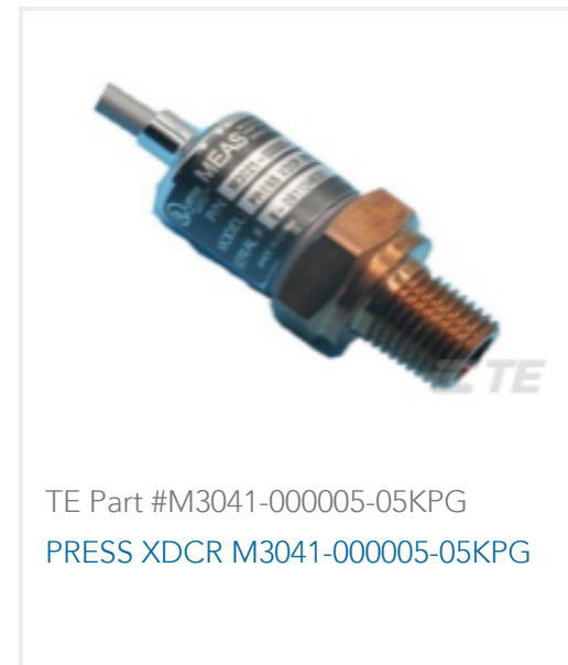
TE Part #M3041-000005-05KPG PRESS XDCR M3041-000005-05KPG