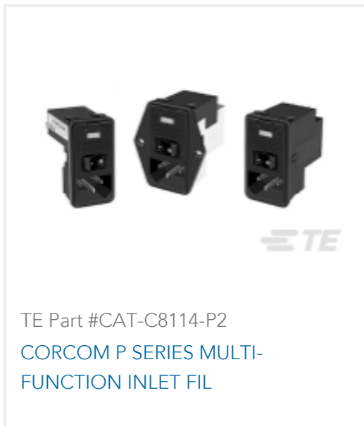
TE Part #CAT-C8114-P2 CORCOM P SERIES MULTI- FUNCTION INLET FIL