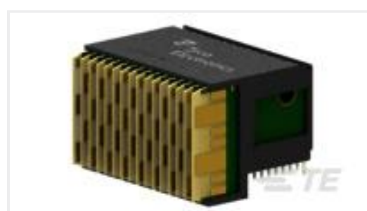
TE Part #1410187-3 MULTIGIG RT T2 7RW DC DF CT