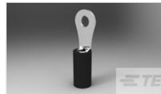
TE Part #50829 TERMINAL,PIDG PTFE, R 26-24 4