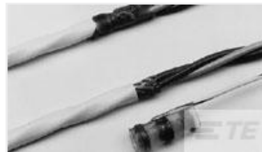
TE Part #775210-000 S01-03-R