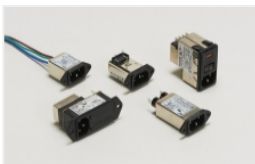
Power Entry Modules(1)