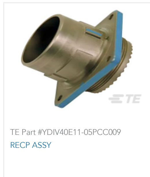
TE Part #YDIV40E11-05PCC009 RECP ASSY