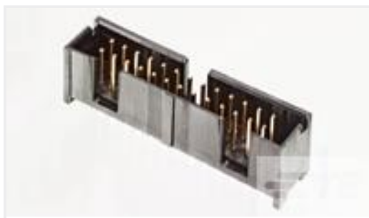
TE Part #5103308-1 A/L LOW PRO HDR 10P VERT BLACK