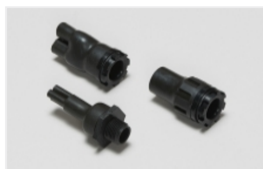
Cable Entry Seals(19)