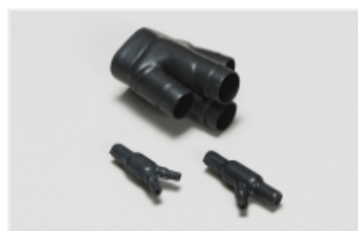
Cable Transitions & Breakouts(2)