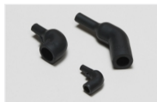
Heat Shrink Boots(1)