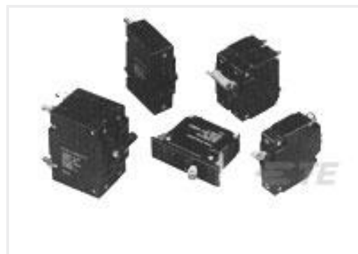
TE Part #1-1393255-0 W93-X112-40=M6/M7/M9/W6/W7