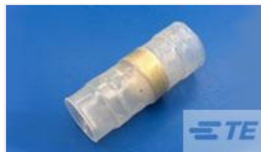
TE Part #690886-000 B-050-00