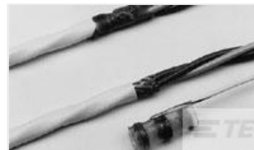
TE Part #E39668-000 B-155-13