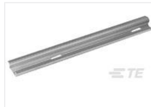
TE Part #1419111-6 24A110=TRACK, MOUNTING