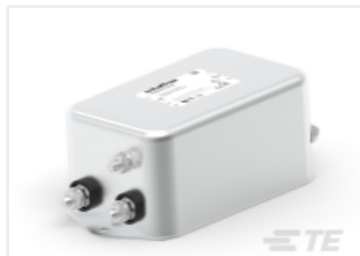
TE Part #821028-SF FN2090-10-08