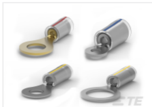
TE Part #CAT-P592-R472 PIDG Radiation Resistant C Rings /Spades