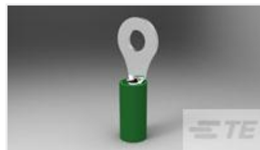
TE Part #50831-1 TERMINAL,PIDG PTFE R 22-20 6