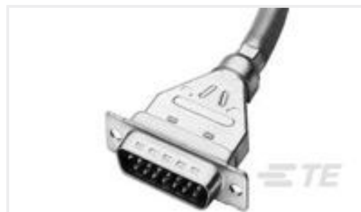
TE Part #1658647-1 KIT,HDP-20,OVRMLD,PLUG,SIZE 2,