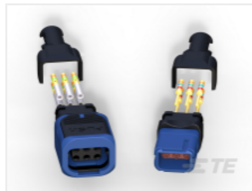
TE Part #YD369-P66-BS000000 369 6 WAY PLUG, NO CONTACTS, SKT