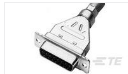
TE Part #1658651-1 KIT,HDP-20,OVRMLD,RCPT,SIZE 4,