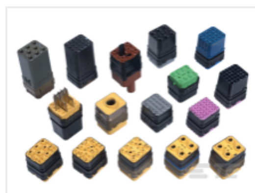
TE Part #2226454-1 PIN INSERT, 16-02 CABLE APPLIED