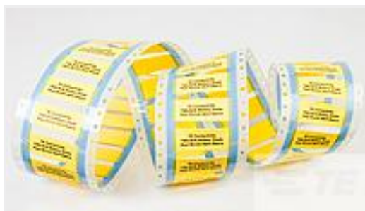
TE Part #7474490001 TMS-SCE-1K-1/4-2.0-9