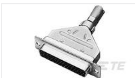
TE Part #1658687-1 HDP-22,OVRMLD,RCPT KIT,SIZE 2,