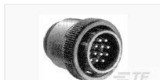
TE Part #206429-1 CPC PLUG ASSY, 11-4, REV SEX