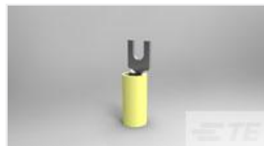
TE Part #1-322985-0 TERMINAL,PIDG SPD 12-10 6