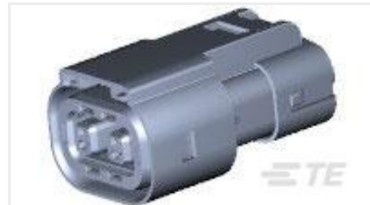
TE Part #2103149-4 PLUG, HVIL ONLY, KEY D, HVA280-2PHI