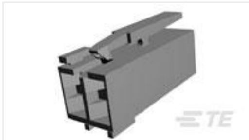
TE Part #6-1241961-2 STD TIM HOUSING MKII 2POS