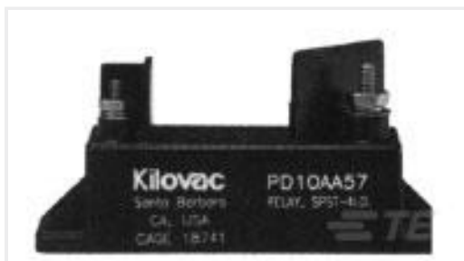
TE Part #1-1618256-5 PD10BB57=RELAY, VACUUM, SPST-N