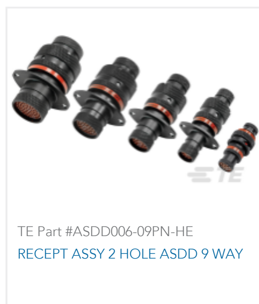
TE Part #ASDD006-09PN-HE RECEPT ASSY 2 HOLE ASDD 9 WAY