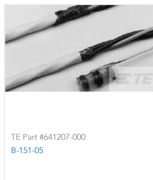
TE Part #641207-000 B-151-05