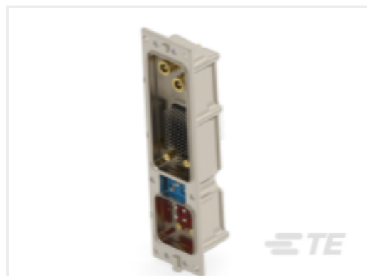
TE Part #2221968-2 A600, REC ASSY, SZ2, (C4/120T2 /13C2), NG