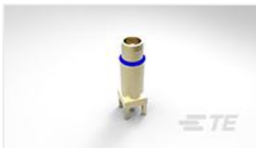
TE Part #1663572-1 OSP/BMA VERTICAL PCB PLUG