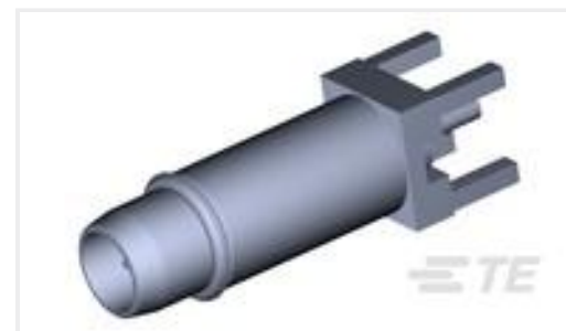
TE Part #1663572-2 OSP/BMA VERTICAL PCB PLUG W/ CUTOUT