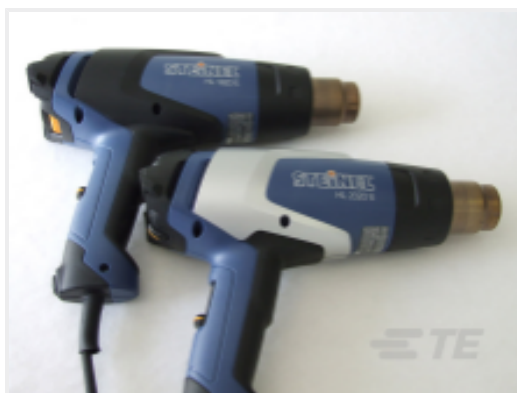
TE Part # EG8162-000 HL1920E-230V-EURO