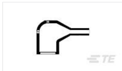
TE Part #711379-000 224K012-25/86-0