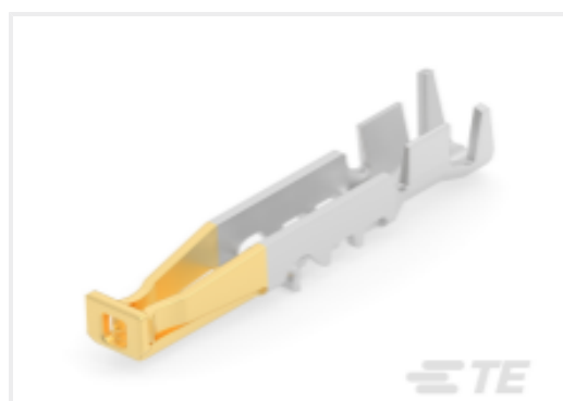
TE Part #464763-E SRCROL A 2,54 2 C2022 500 137 * 9999 J 2