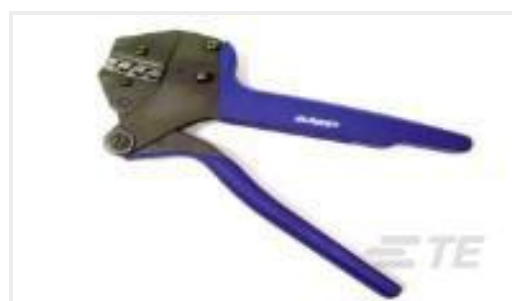
TE Part #539635-1 ERGO HAND TOOL FRAME W/O DIES