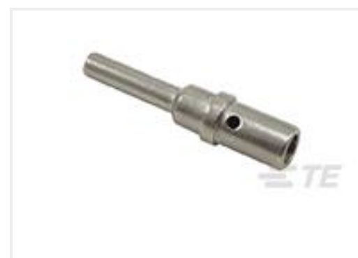
TE Part #0460-204-12141 PIN, SOLID, SIZE 12, 12-14AWG, NI