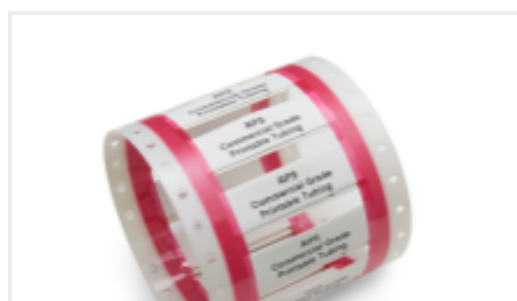
TE Part #2866050001 RPS-22-18/2.0-4