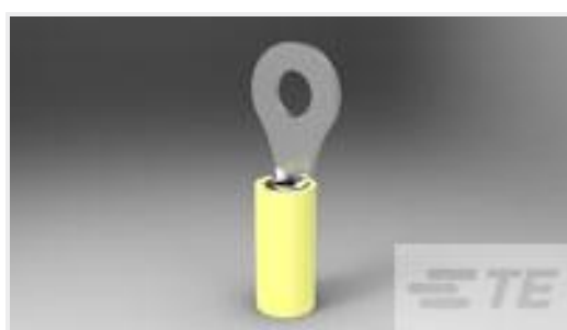
TE Part #320634 TERMINAL,PIDG R 12-10 6