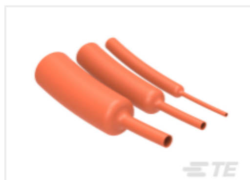
TE Part #CAT-HST-CGPT2 CGPT 3:1 Heat Shrink Tubing