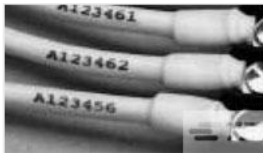
TE Part #5053172028 RNF-100-3/8-6-STK