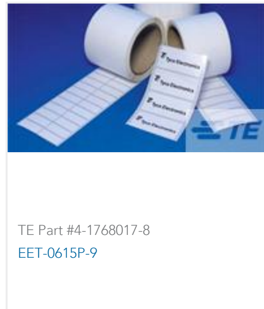
TE Part #4-1768017-8 EET-0615P-9