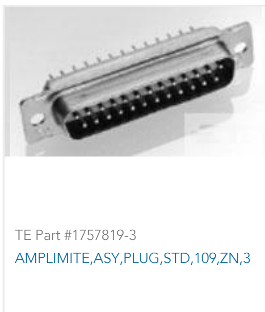
TE Part #1757819-3 AMPLIMITE,ASY,PLUG,STD,109,ZN,3