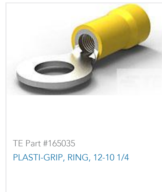
TE Part #165035 PLASTI-GRIP, RING, 12-10 1/4