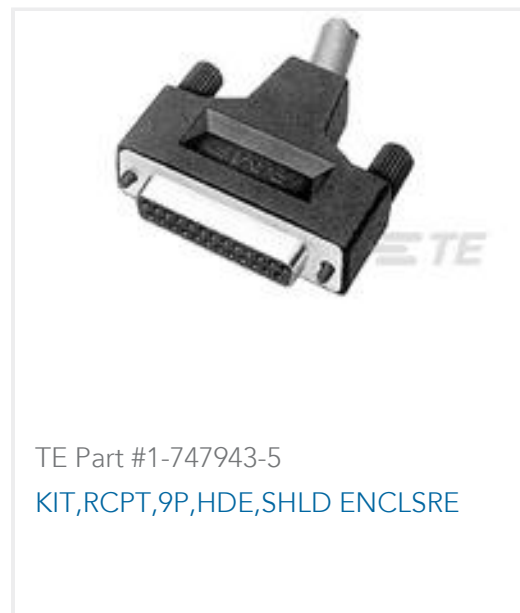
TE Part #1-747943-5 KIT,RCPT,9P,HDE,SHLD ENCLSR