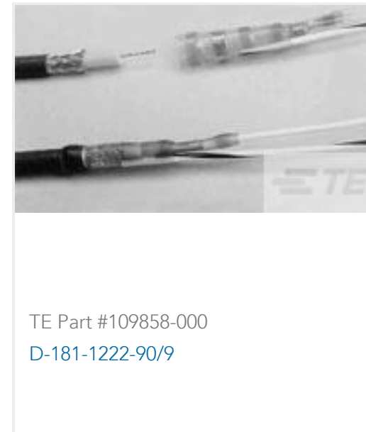
TE Part #109858-000 D-181-1222-90/9