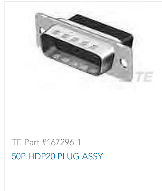
TE Part #167296-1 50P.HDP20 PLUG ASSY