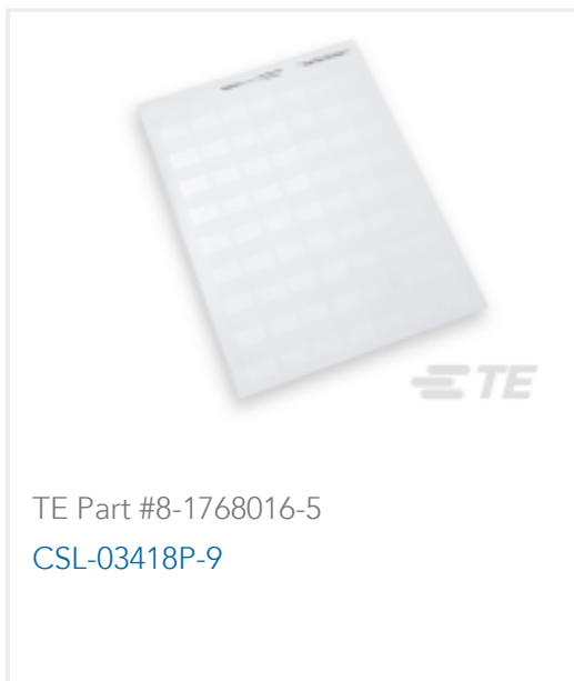
TE Part #8-1768016-5 CSL-03418P-9