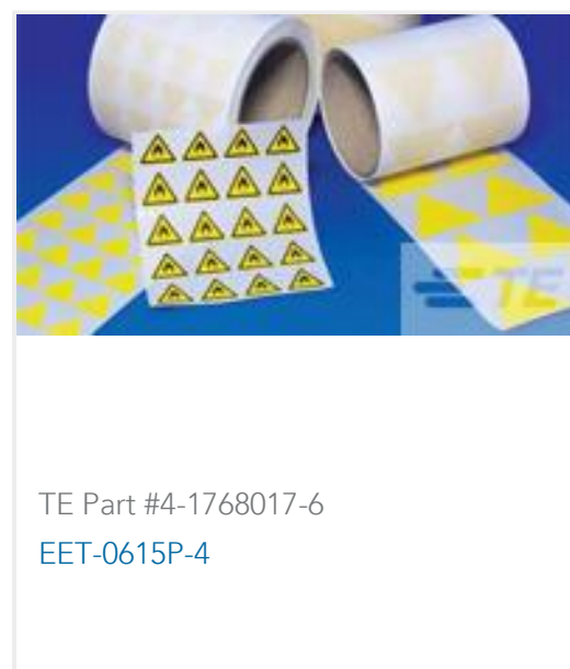
TE Part #4-1768017-6 EET-0615P-4