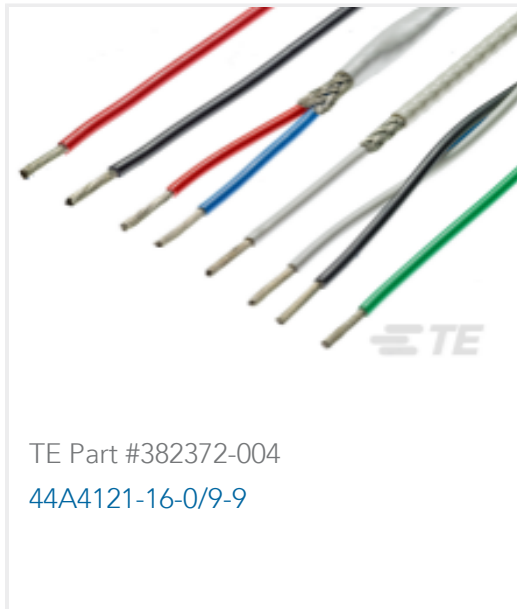
TE Part #382372-004 44A4121-16-0/9-9