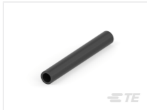
TE Part #CAT-HST-VERSAFITV2 Versafit-V2 Heat Shrink Tubing