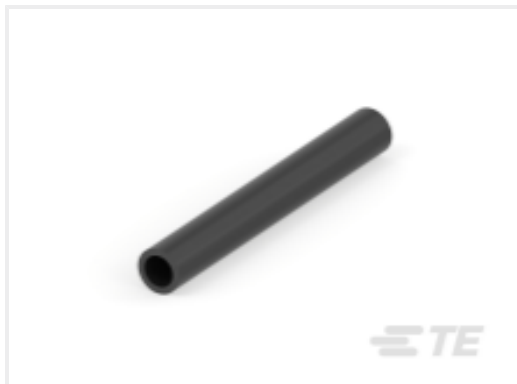
TE Part #CAT-HST-VERSAFITV4 Versafit-V4 Heat Shrink Tubing