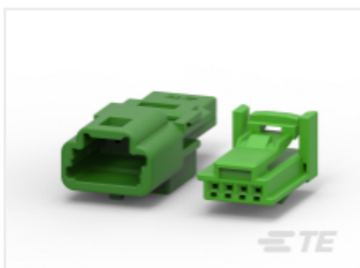
TE Part #CAT-T319-CH8172 TH/025 CONNECTOR SYSTEM, HOUSING