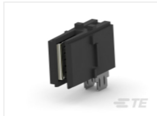
TE Part #2178410-1 CROWN CLIP JUNIOR CONN