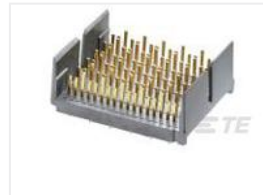
TE Part #1934505-1 Tinman header Assy 6x8 Open