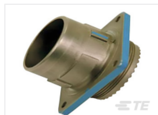
TE Part #YDIV46E21-35SNV001 PLUG ASSY