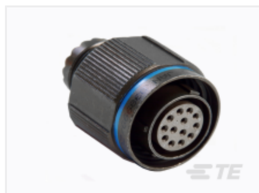
TE Part #CAT-D38999-DTS23L D38999: Straight Plug, 11-98 Insert