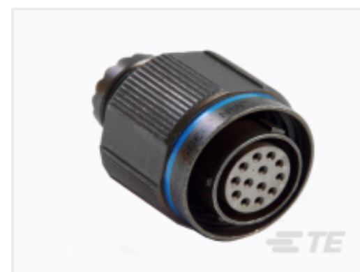
TE Part #YDTS26F17-35SCV001 PLUG ASSY