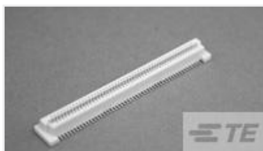
TE Part #5177983-3 0.8FH,R05H.5,080,08/Sn,TU