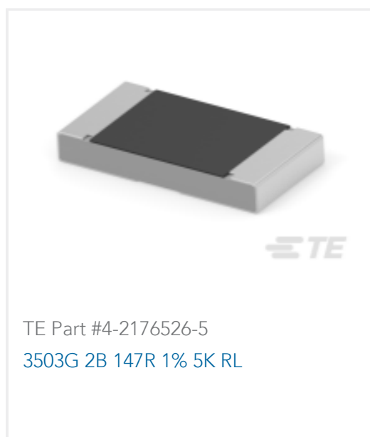
TE Part #4-2176526-5 3503G 2B 147R 1% 5K RL