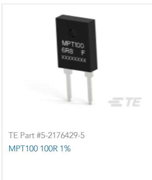
TE Part #5-2176429-5 MPT100 100R 1%