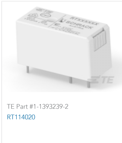
TE Part #1-1393239-2 RT114020