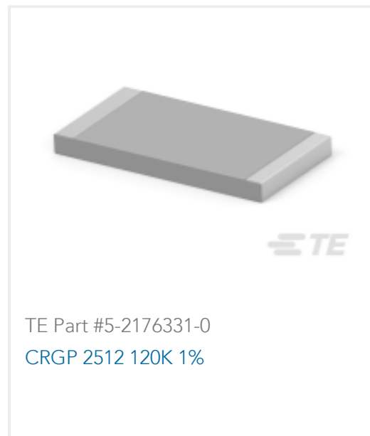
TE Part #5-2176331-0 CRGP 2512 120K 1%