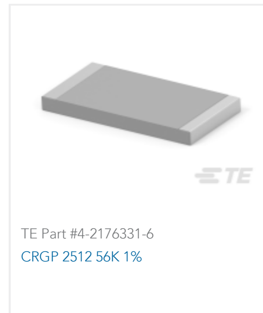
TE Part #4-2176331-6 CRGP 2512 56K 1%