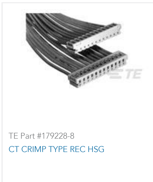
TE Part #179228-8 CT CRIMP TYPE REC HSG