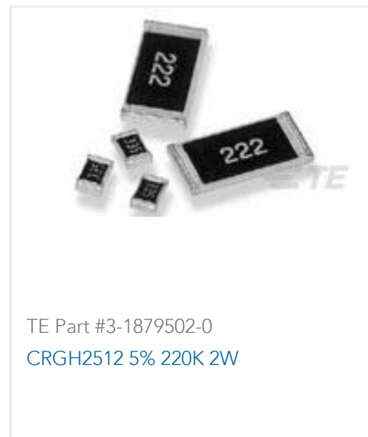
TE Part #3-1879502-0 CRGH2512 5% 220K 2W