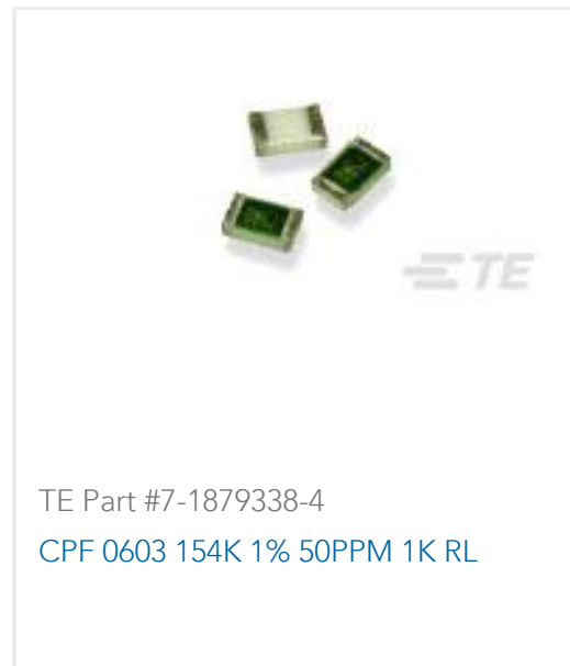
TE Part #7-1879338-4 CPF 0603 154K 1% 50PPM 1K RL