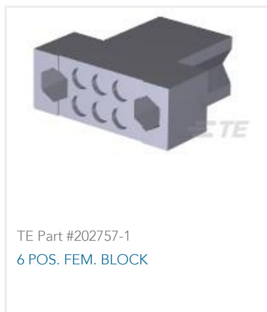
TE Part #202757-1 6 POS. FEM. BLOCK