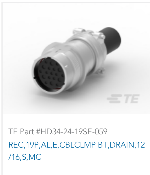
TE Part #HD34-24-19SE-059 REC,19P,AL,E,CBLCLMP BT,DRAIN,12 /16,S,MC