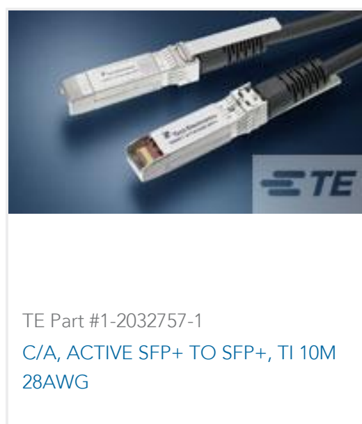
TE Part #1-2032757-1 C/A, ACTIVE SFP+ TO SFP+, TI 10M 28AWG