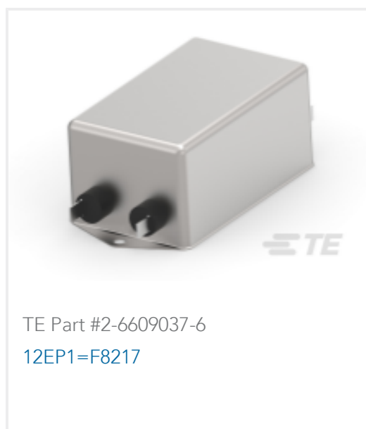
TE Part #2-6609037-6 12EP1=F8217