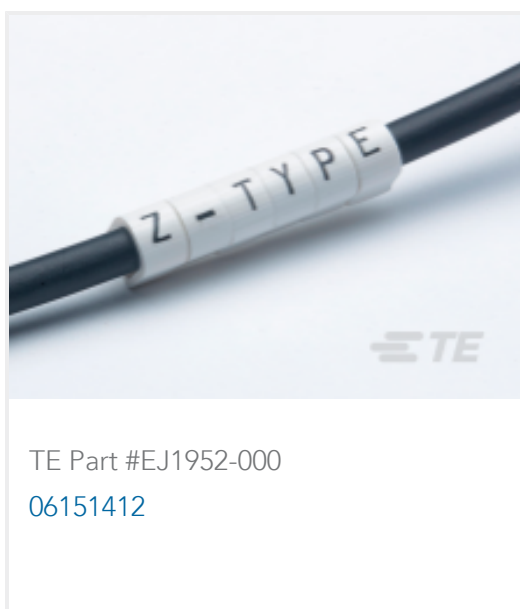
TE Part #EJ1952-000 06151412