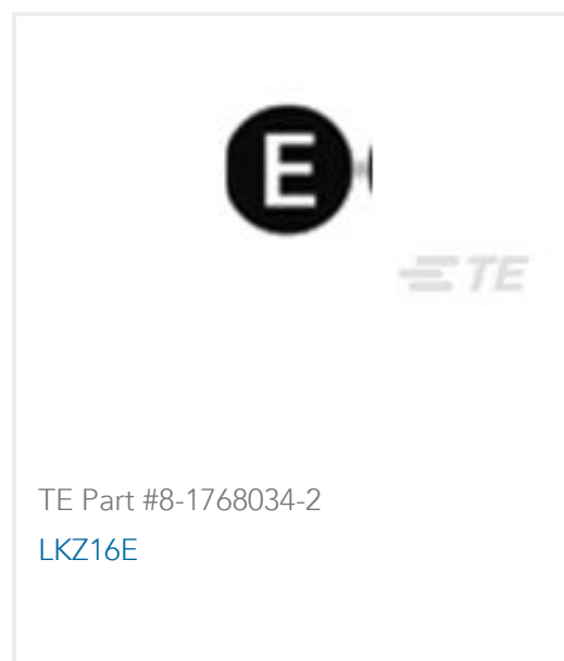
TE Part #8-1768034-2 LKZ16E