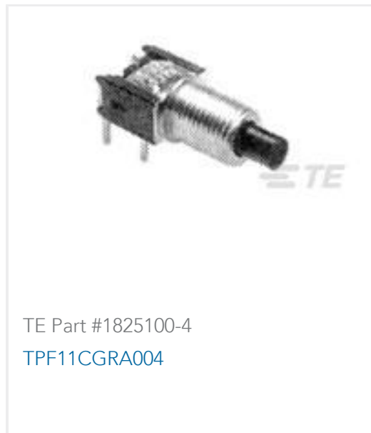
TE Part #1825100-4 TPF11CGRA004