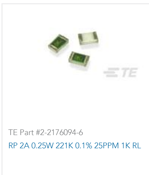
TE Part #2-2176094-6 RP 2A 0.25W 221K 0.1% 25PPM 1K RL