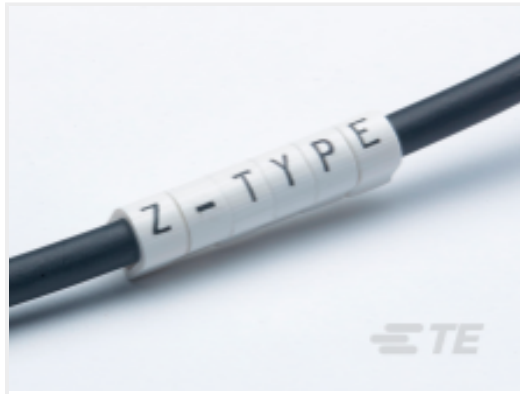
TE Part #EC0209-000 05811505