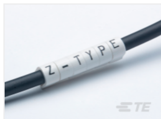
TE Part #EC0212-000 05811808