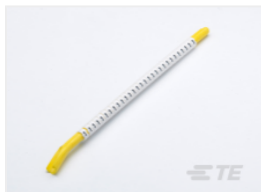
TE Part #CAT-T3437-ST2999 STD Snap-On Markers