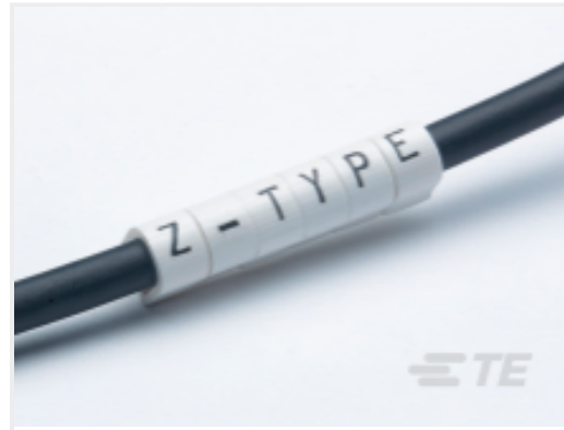
TE Part #EC0222-000 05811909