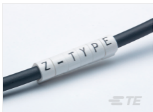
TE Part #EC0581-000 06161808