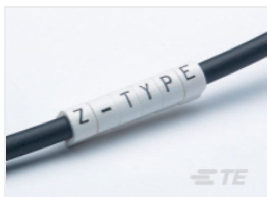
TE Part #EC0180-000 05811202