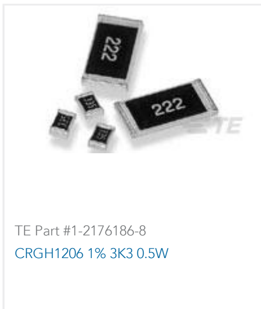
TE Part #1-2176186-8 CRGH1206 1% 3K3 0.5W