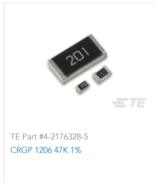
TE Part #4-2176328-5 CRGP 1206 47K 1%